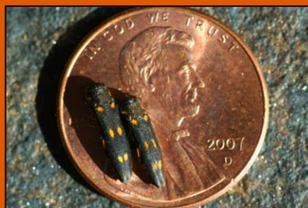
Goldspotted Oak Borer