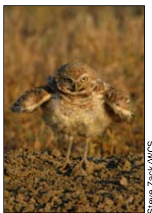
Burrowing owls nest in burrows dug out by other grassland species, such as prairie dogs.