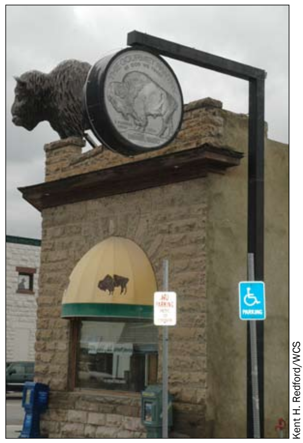
The bison remains a cultural icon in North America to this day.