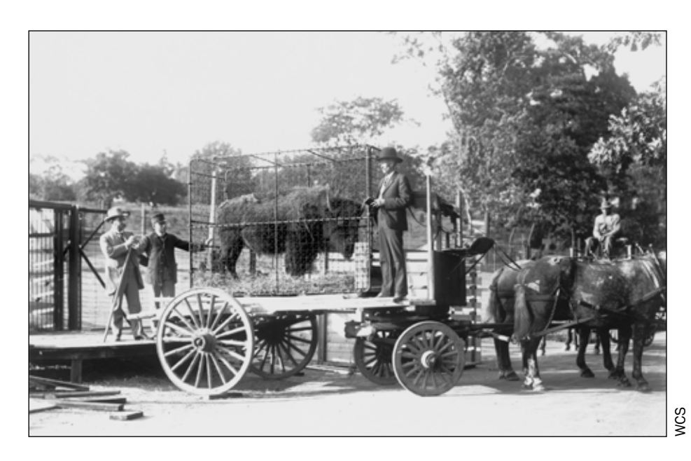
In 1907, WCS shipped 15 of the Bronx Zoo's bison to the Wichita Reserve Bison Refuge in Oklahoma.

opportunity for open dialogue on the many facets of bison conservation that are outlined in this working paper.