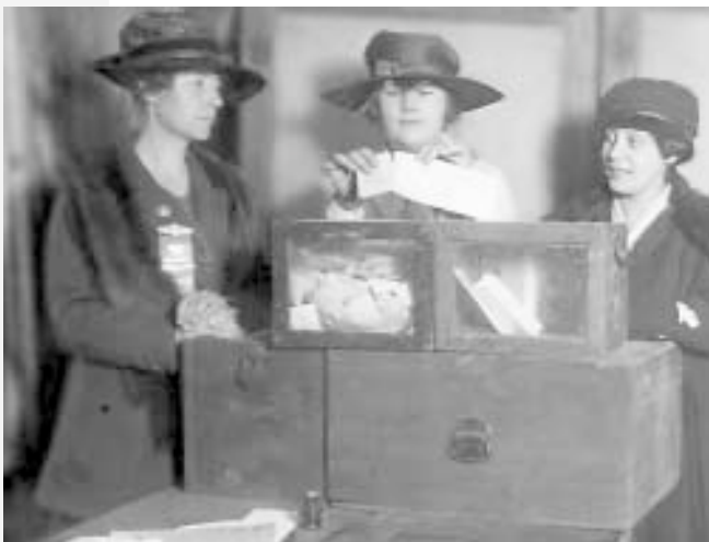
Three Suffragists Casting Votes in New York City, c. 1917

all, nearly 300 known women's rights history properties were identified. The largest number of properties in the Northeast were in Massachusetts and New York. In Massachusetts, most of the known properties were clustered in the Greater Boston area. In New York, they were dispersed throughout the state with a cluster of properties located in a crescent shaped area roughly bounded by Rochester in the west, Syracuse in the east, and Seneca Falls and Waterloo in between. Based on existing information, a fairly dense corridor of women's rights history properties is also found along the Eastern Seaboard, running from Boston to Washington, DC.