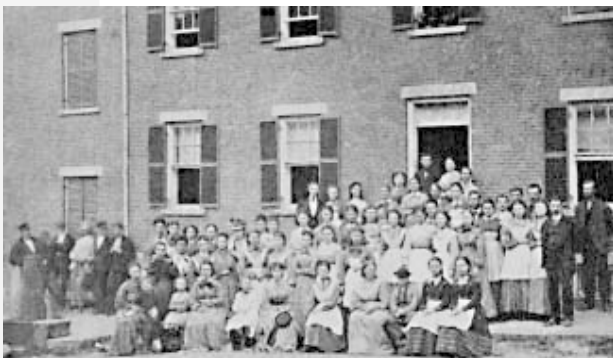
Residents of Boott Mill Boarding House, c. 1880, Lowell, MA