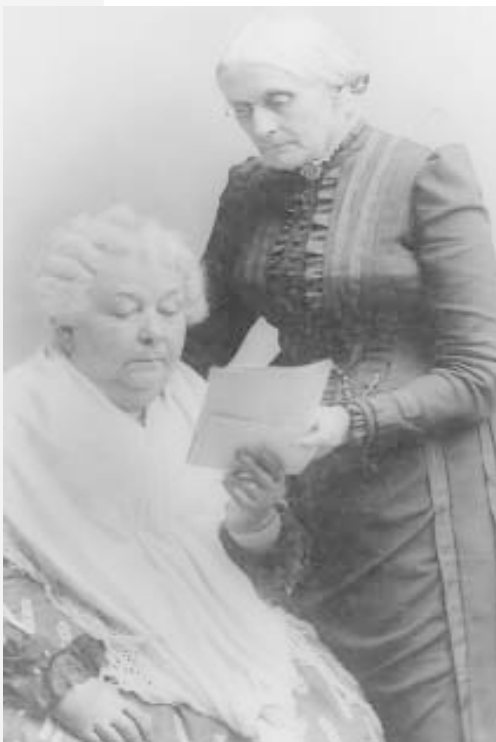
Elizabeth Cady Stanton & Susan B. Anthony

The study team also considered the feasibility of designating a long-distance auto tour route in the corridor between Boston and Buffalo. While there are heavy concentrations of properties in the Greater Boston area in Massachusetts and in the Rochester-Seneca Falls-Syracuse area of New York, an extensive area between these two