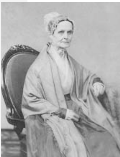
Lucretia Mott, c. 1870

He has made her morally, an irresponsible being, as she can commit many crimes with impunity, provided they be done in the presence of her husband. In the covenant of marriage, she is compelled to promise obedience to her husband, he becoming, to all intents and purposes, her master—the law giving him power to deprive her of her liberty and to administer chastisement.