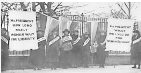
Suffragists picketing the White House, February 1917