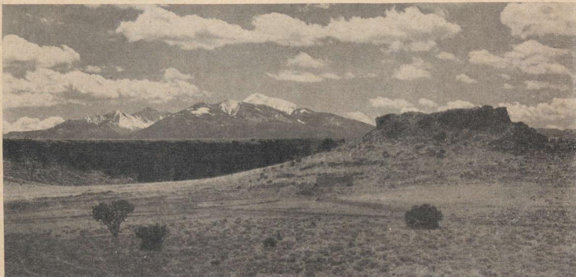
The Citadel overlooking Nalakihi and the limestone sink

Around the Citadel was another concentration of prehistoric Indians. Within 1 square mile there are more than 100 sites, varying in size from earthlodges to the larger pueblos. The Citadel itself, as yet unexcavated, is a fortified apartment house. Probably it was 1 or 2 stories high and contained nearly 50 rooms. Its impregnable position on top of a small lava-capped mesa, overlooking a wide expanse of country, suggests that it served as a retreat during times of stress. Numerous loopholes through the thick walls strengthen this impression. On the ter-