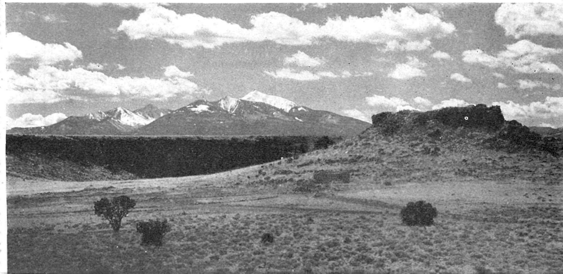
The Citadel overlooking Nalakihiu and the limestone sink

Around the Citadel was another concentration of prehistoric Indians. Within 1 square mile there are more than 100 sites, varying in size from earthlodges to the larger pueblos. The Citadel itself, as yet unexcavated, is a fortified apartment house. Probably it was 1 or 2 stories high and contained nearly 50 rooms. Its impregnable position on top of a small lava-capped mesa, overlooking a wide expanse of country, suggests that it served as a retreat during times of stress. Numerous loopholes through the thick walls strengthen this impression. On the ter-