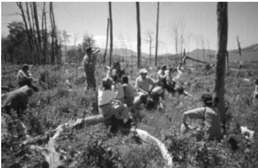
Yellowstone resource management specialist Roy Renkin discusses the northern range with the NAS committee during a 1999 visit.

YNP resource managers consider the northern range to be in acceptable condition and the role and numbers of ungulates and other wildlife appropriate for a national park, and the best available scientific evidence does not indicate that ungulate populations are irreversibly damaging the northern range (Chapter 4). In addition, several signifi-