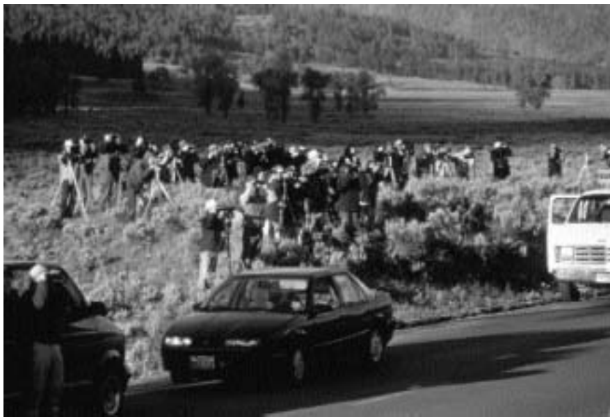
Yellowstone's highly visible wolves in Lamar Valley present park managers with extraordinary educational opportunities.

everyone—there are fewer aspen and willows than in some similar ecosystems elsewhere—the committee concludes that the northern range is not on the verge of crossing some ecological threshold beyond which conditions might be irreversible. The same is true of the region's sagebrush ecosystems, despite reductions in the number and size of plants in some lower-elevation areas.