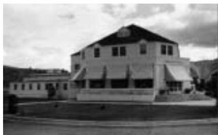
The Mammoth Hot Springs Hotel and dining facilities are in the newly designated historic district.