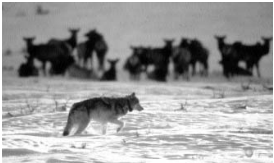
A radio-collared wolf stalks elk.

A second recurrent theme in our report has been the importance of spatial scale. The northern range is an incomplete ecosystem for large herbivores that rely on heterogeneity in the distribution of foods that vary seasonally in abundance, quality, and availability. A large spatial extent provides reserve areas that may not be preferred during normal years but can be used during times of shortage. The importance of the heterogeneity that normally accompanies a large spatial extent was emphasized by Walker et al. (1987), who examined drought-caused mortality of ungulates in African reserves that varied in size from 442 to 19,000 km 2 . Mortality was relatively low in the large reserves because animals expanded their normal range and used reserve areas that were far from normal water sources during droughts. Walker et al. (1987) concluded that culling was unnecessary if there was sufficient spatial heterogeneity to provide reserve forage. Similarly, during severe winters ungulates in the northern range use areas outside park boundaries. However, many of these key areas are not