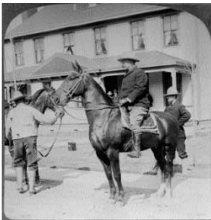
T.R. on Officer’s Row in Mammoth, 1903.

In 1919, Roosevelt passed away at his home at Sagamore Hill, New York. With his death, Yellowstone lost not only one of its most important defenders, but also one of its early wildlife managers. Roosevelt’s handling of predators in Yellowstone will always be debated as having been good or bad. Yet one thing is clear: Roosevelt attempted to establish policies that he believed were in the park’s best interest as he understood it at the time. Unfortunately, he did not understand many of the environmental changes that were occurring in Yellowstone, nor did he recognize how drastically the environment had been changed by those before him, especially how much damage had been done to the predator populations. He also believed that the natural increase of the elk populations and the effects of winter kills, which are now recognized as part of the natural process in Yellowstone’s ecosystem, were inhumane and needed to be managed with what he viewed as more humane methods. Despite these shortcomings, Roosevelt’s changes to Yellowstone’s predator control policies were fairly advanced for his day and age. Roosevelt must be given credit for his effort to look beyond the image of