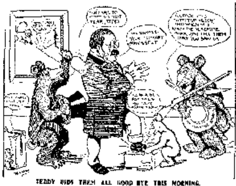
An editorial cartoon's depiction of Roosevelt's 1903 Yellowstone visit. Note the mountain lion perched outside the window.

Although the hunting of many ungulate species ended in 1883 by a directive of the Secretary of the Interior, park officials continued killing predators throughout the end of the 19th century and into the early 20th century. Many