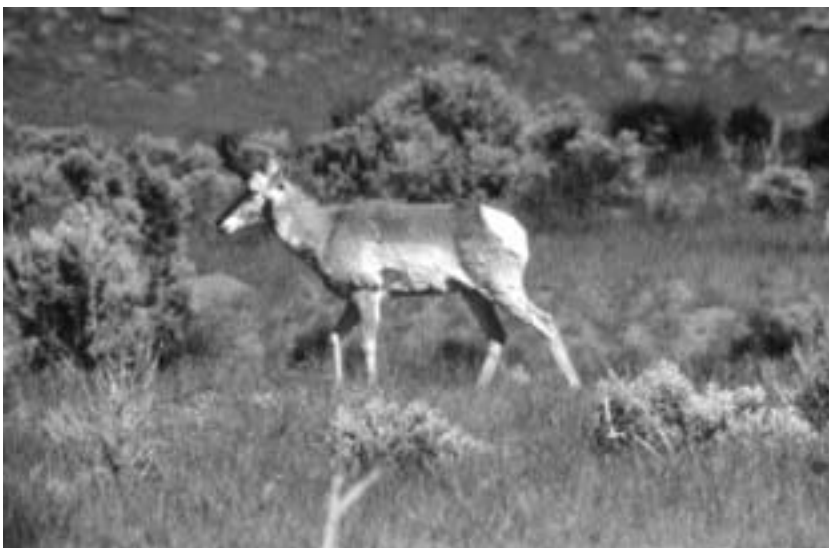
Pronghorn antelope. NPS photo.

Although dramatic ecological change does not appear to be imminent, it is not too soon for the managers of YNP and others to start thinking about how to deal with potential changes. Before humans modified the landscape of the GYE—limiting access to much of it and interrupting migration routes—animals could respond to environmental changes by moving to alternative locations. To a lesser degree, and over longer time frames, plants could adapt as well, especially in places with significant topographic relief. But many options that organisms formerly had for dealing with environmental changes have been foreclosed because of human development of the region. Human-induced climate change is expected to be yet another long-term influence on the ecosystem. Reconciling the laudable goals of preserving ecosystem processes and associated ecosystem components with human interests and influences on wildlands will be a growing challenge in the future, not only in the GYE. That reconciliation will involve conflicting policy goals, incomplete scientific information, and management challenges. Resolving these conflicts will require all the vision, intellectual capacity, financial resources, and goodwill that can be brought to bear on them. 🌍