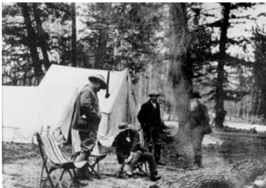
President Theodore Roosevelt (left) in camp near Tower, Yellowstone National Park, with John Burroughs (right), April 1903.

On April 8, 1903, Theodore Roosevelt arrived in Yellowstone National Park for his long anticipated visit. Famed naturalist and writer John Burroughs accompanied Roosevelt during his visit, which lasted for over two weeks. During this time, Roosevelt and Burroughs spent most of their time studying the park's wildlife. Roosevelt fired only one shot within the park. Using a tree for a target, he tested a new revolver, only to have the spent shell fly