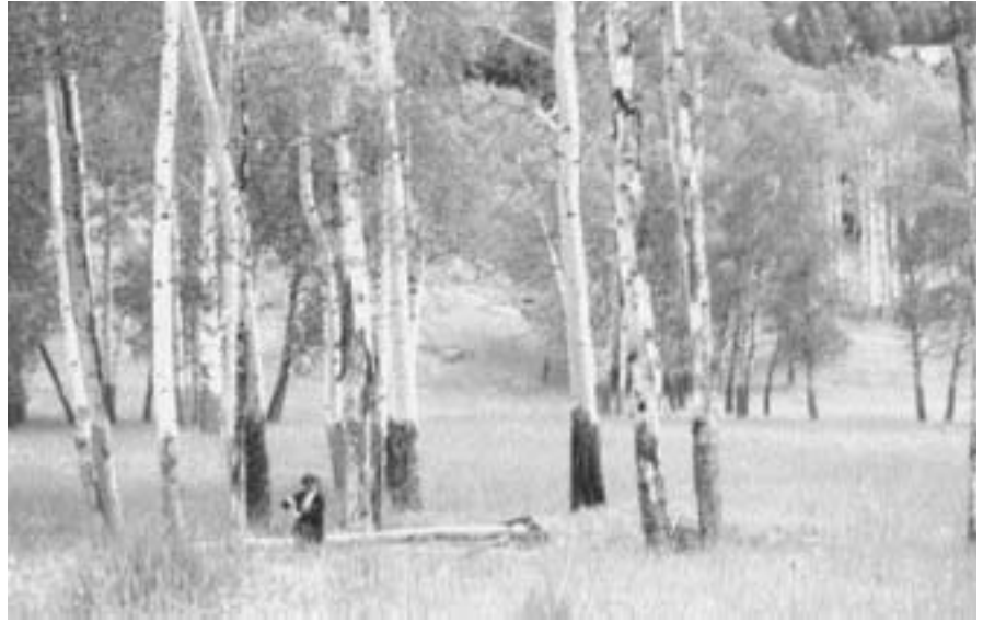
An aspen stand on the northern range.

elk were greatly reduced or eliminated for a long enough time, as seems to have happened during the market hunting period of the 1880s (Romme et al. 1995), recruitment of tree-sized aspen would be likely under the current climate. What circumstances that previously existed, but are no longer present, might have permitted recruitment? The most obvious is that elk did not use aspen for winter survival because they migrated to lower areas with alternative winter food sources. Another possibility is that a combination of severe winters and a healthy predator population greatly reduced elk numbers or their distribution.