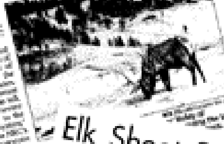
...Elk and Bison Not Causing Ecological Damage at Yellowstone Park