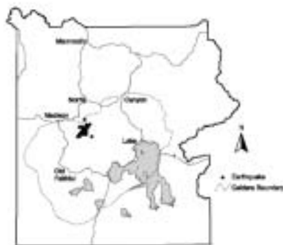
Location of January 15, 2002, earthquake swarm. Map by Henry Heasler.

For real-time seismic data for Yellowstone visit: www.seis.utah.edu/reactivity/recent.shtml ; for crustal motion data from the Yellowstone GPS (Global Positioning System) monitoring network visit: www.mines.utah.edu/~rbsmith/RESEARCH/UUGPS.html .