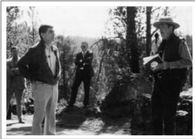
Presidential hopeful Michael Dukakis visited the park to view the fires in September of 1988.

First, in 1988, the media buried us, and announced that Yellowstone was destroyed. Then, in 1989, on their way home from the big Exxon oil spill, they stopped by Yellowstone for the rebirth story, to celebrate the phoenix rising from the ashes. They said the rumors of Yellowstone's death were greatly exaggerated, as if they hadn't been the very people to start those rumors the year before. I'm glad they finally got it right, but it was quite a show.