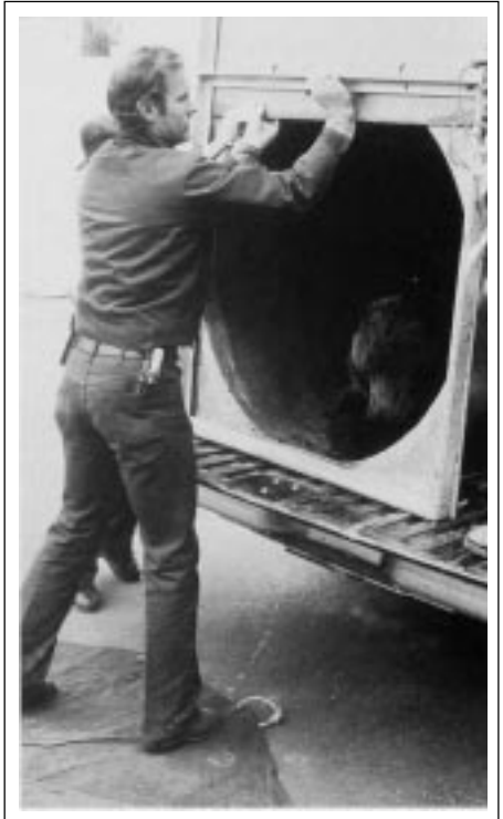
The circa-1930 rangers (above left) probably would have appreciated the greater ease of operating and moving the modern trap (above right and following page), but they got the job done despite their primitive equipment.

unfamiliar surroundings of their new home range.