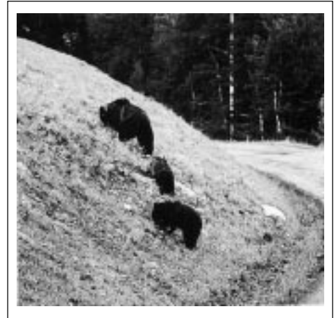
Unlike the days of open garbage pits, many of today's bear problems stem from bears eating natural foods, but doing so too close to developments.

It appears that the difficulty in condi-