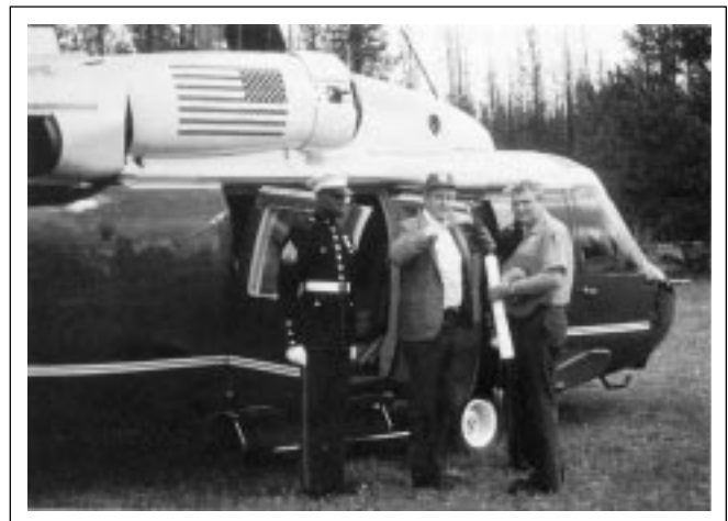
President George Bush's June 1989 visit highlighted the "rebirth" news stories during the first spring after the fires.