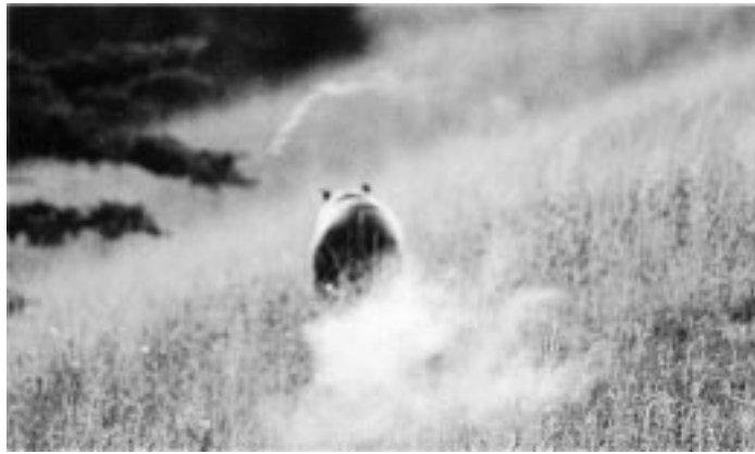
Wyoming Game &amp; Fish

Among the methods used to move bears from an area is firing "cracker shells," which explode like a firecracker near the bear, as shown above. These were not tested in the study described here. The authors experimented with a combination of rubber bullets (right), water-filled cartridges, and recorded bird calls that were intended to condition the bear to flee at the sound of the call without being shot at again.