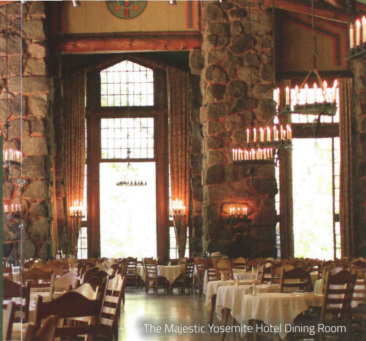
The Majestic Yosemite Hotel Dining Room

*Visit us on-line or check with the front desk for dates and hours of operation.