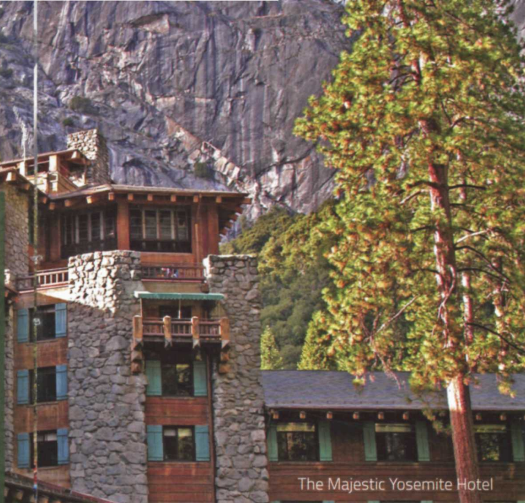
The Majestic Yosemite Hotel

There's no greater convenience than staying right in Yosemite National Park—waking up with all the park's natural wonders right at your doorstep. From elegant hotels with exceptional service to rustic canvas tent cabins, you'll find the perfect place to settle in—surrounded by some of the most beautiful scenery on earth.