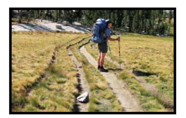
PREVENT NEW TRAIL RUTS: Stay on the trail even if it is muddy or the route is longer to avoid creating unintended trails

Leave no trace of your visit. While you are in the wilderness, you may encounter hazards due to human influences, such as contaminated water and animals that want to eat your food. With your help and care, we can reduce these human-caused changes to keep these wild lands unimpaired for future generations. Keeping wilderness wild depends on you.