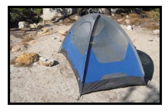
PROPER CAMPSITE SELECTION: Camp on a durable surface such as sand, gravel, or rock 100 feet away from water sources and the trail.