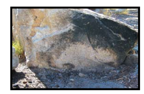
CAMPFIRES: Only use pre-existing fire rings. Don't leave permanent blackened scars by creating campfires at the base of rocks.