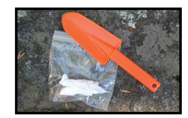
waste Disposal: Bury human waste and pack out toilet paper and hygiene products to avoid unsanitary and unsightly items in the wilderness.