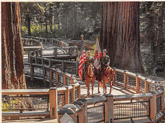
Yosemite Mounted Patrol serving as the Color Guard at Mariposa Grove of Giant Sequoias Dedication Ceremony, June 14, 2018

Yosemite National Park Ranger, 1983-2012