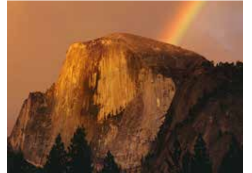
Half Dome, Christine White Loberg

This publication was made possible by the Yosemite Park Partners listed on this page. Read more below or visit www.yosemitepartners.org to learn more about helping these organizations provide for the future of Yosemite National Park.