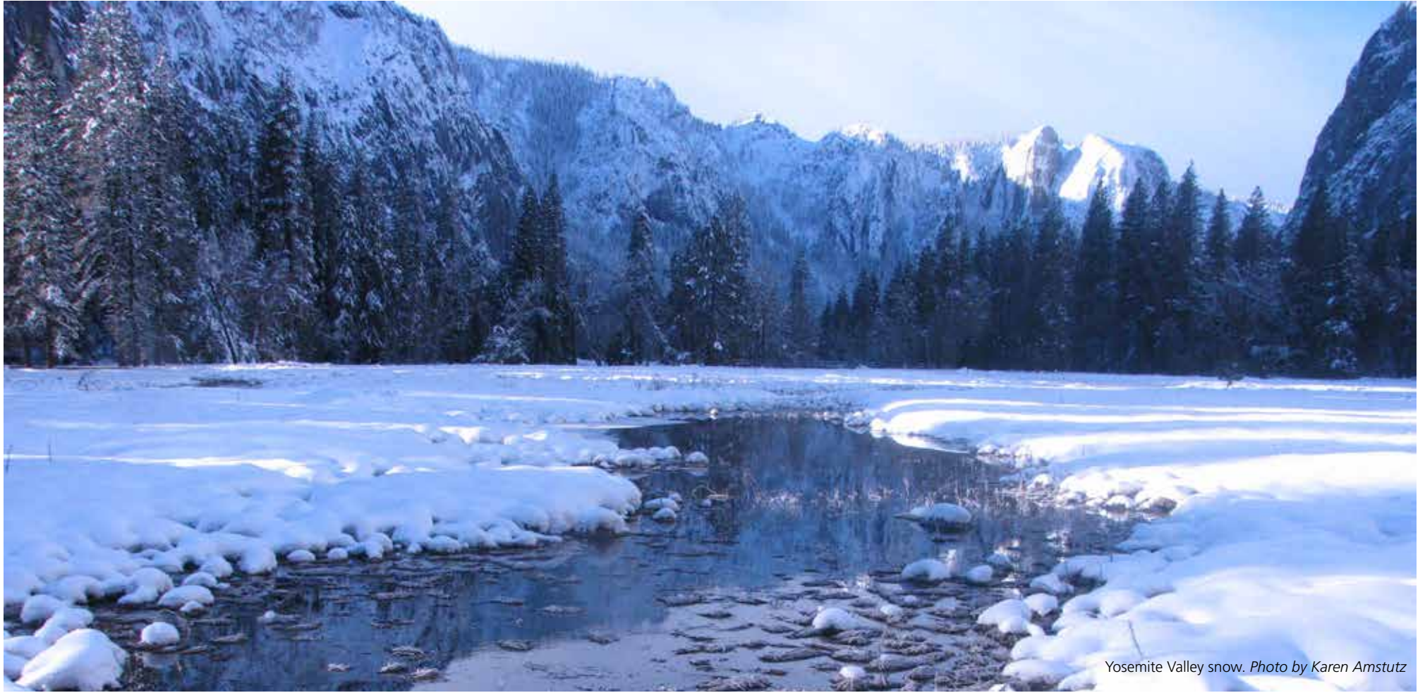
Yosemite Valley snow.

Low-angle winter sun creeps along the south rim of Yosemite Valley, bathing the landscape in soft, glinting light. Visiting the park this time of year, your footsteps crunching in the snow may be the only sound you hear. Most deciduous trees are reduced to bare branches decked in rime ice crystals, with a blanket of decaying leaves covering the ground below. Clumps of grasses, decorated with ice and hoarfrost crystals, line the edges of open water in the meadows. The ledges and pinnacles on the cliffs of The Valley may be highlighted with snow while the Merced River quietly carries her waters beneath a layer of ice. Cold, calm days of winter beckon us. Put on our parkas and boots, hats and mittens and get out for a walk to witness the transformed scenery! What unseen struggles for survival are going on behind the scenes? With our awareness peaked by the insulated world around us we notice subtleties and wonder, what tiny birds might be calling in the tops of the towering pines on the coldest of days? Who made those zig zagging tracks in the snow through the forest? What is that coyote hunting for in the snow-covered meadow? When did these countless ladybugs arrive in Yosemite Valley? Where are the bears now? How can these creatures survive the harsh conditions of winter in the mountains? As you walk the wintry trails, engage all your senses to explore and look for clues as to how plants and animals tolerate the cold temperatures and scarcity of food and water winter season.