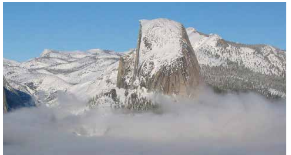
The view from Glacier Point.