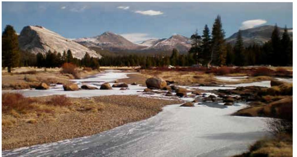
Tuolumne Meadows deep freeze.