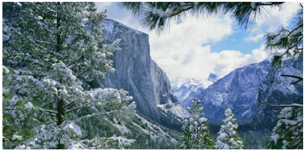
Yosemite Valley in Snow.

6 Hetch Hetchy Reservoir, a source of drinking water and hydroelectric power for the City of San Francisco, is home to spectacular scenery and the starting point for many wilderness trails. The area's low elevation makes it a good place to hike in autumn and winter. The Hetch Hetchy Reservoir is located 40 miles (1¼ hour) from Yosemite Valley via the Big Oak Flat Road (Highway 120W) and the Evergreen Road. The Hetch Hetchy Road is open from 8am to 5pm through March 31. Wilderness permits and bear canisters are available while the road is open. Vehicles and/or trailers over 25 feet long, and RVs and other vehicles over 8 feet wide are not permitted on the narrow, winding Hetch Hetchy Road.