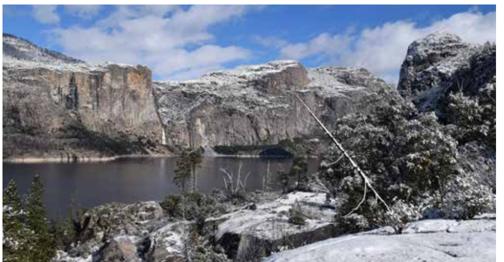
Hetch Hetchy in Winter.