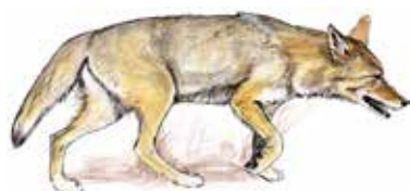
All issue illustrations by Tom Whitworth

Weather in mountainous climates, like Yosemite, varies drastically depending on elevation with temperatures cooling by as much as five degrees for every 1,000 feet of elevation gain; a moderate rain in the Valley can be a white-out blizzard with just a short drive or hike.