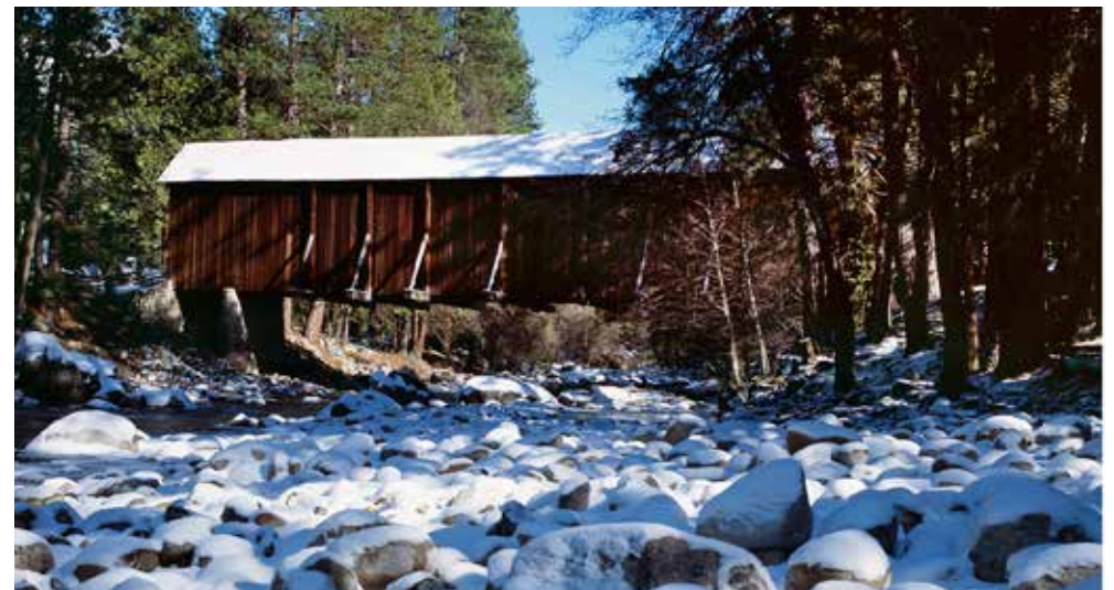
Snow at Wawona's covered bridge.