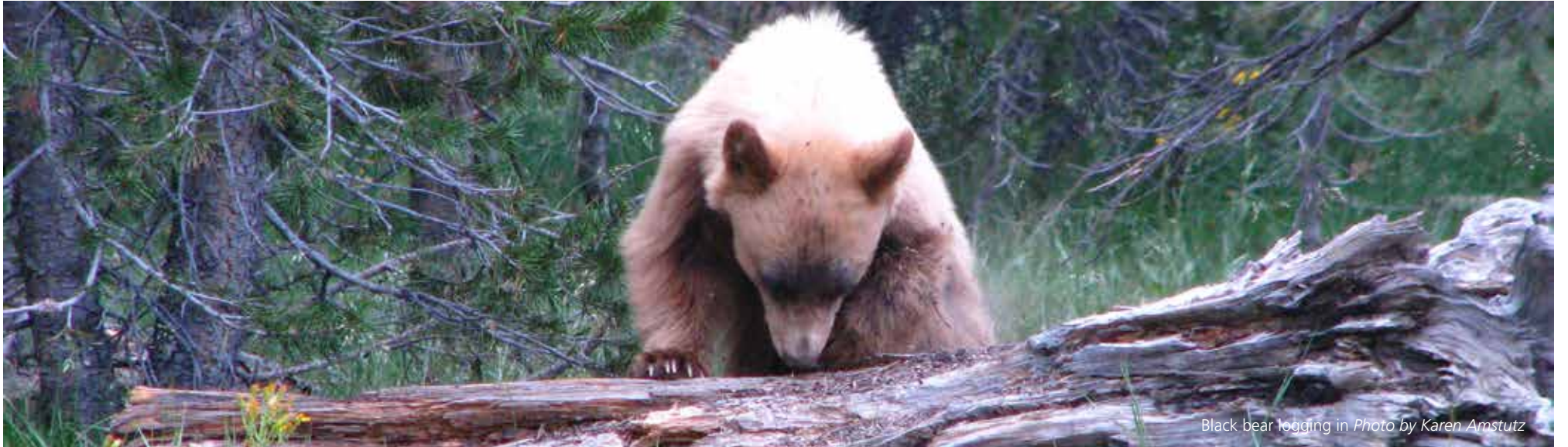
Black bear logging in