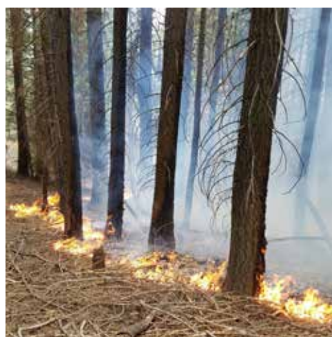
Effects from the 2017 Empire Fire along Glacier Point Road.