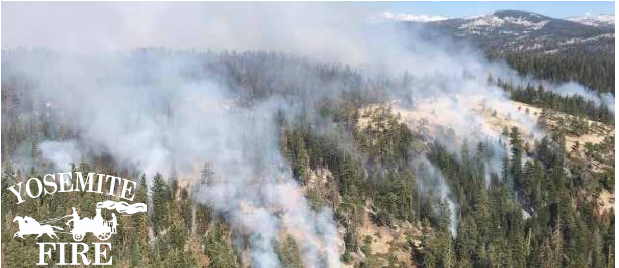
The 2017 Empire Fire near Glacier Point.

As you travel through Yosemite this fall you may notice some smoke and haze. Fire and smoke are as much a part of the Yosemite ecosystem as water and ice. More than 40 years of fire ecology has taught fire managers that suppressing fires results in unnatural fuel buildup and can make fires more severe than they otherwise would have been. Fire managers work to restore healthy forests and reduce the threat of extensive, severe fire by allowing some lightning-ignited wildfires to burn under moderate conditions. They also use prescribed fire and mechanical tree thinning to reduce fuels.