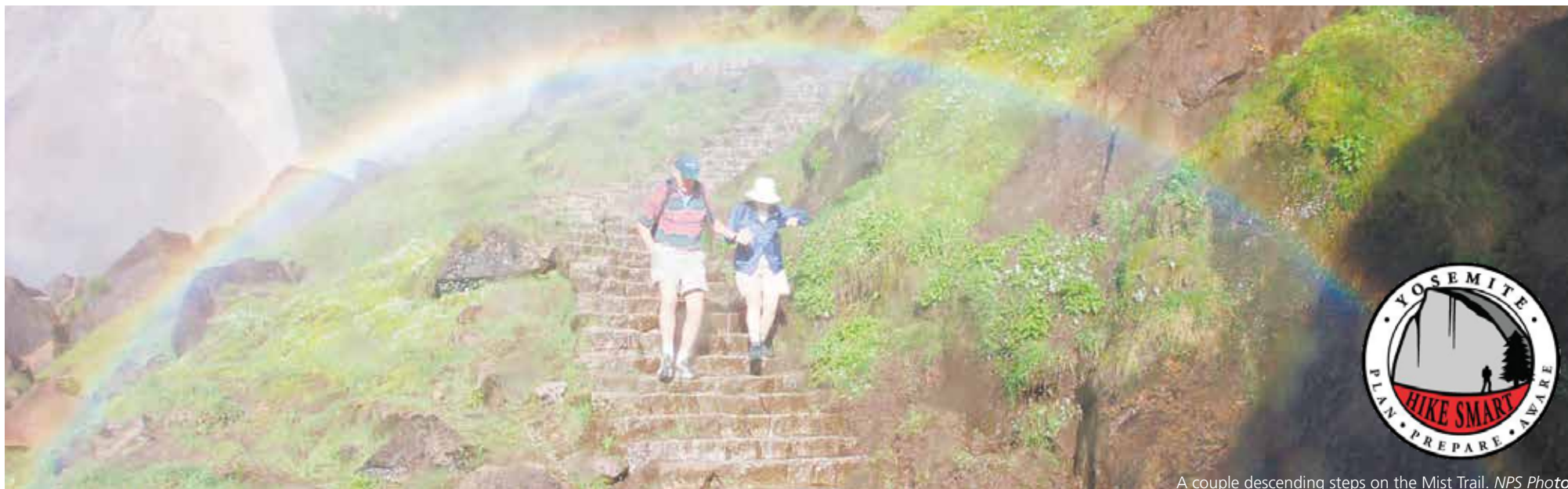
A couple descending steps on the Mist Trail.