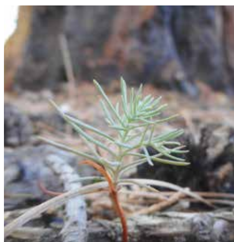
A sequoia seedling emerges from the ground after a 2017 prescribed burn.