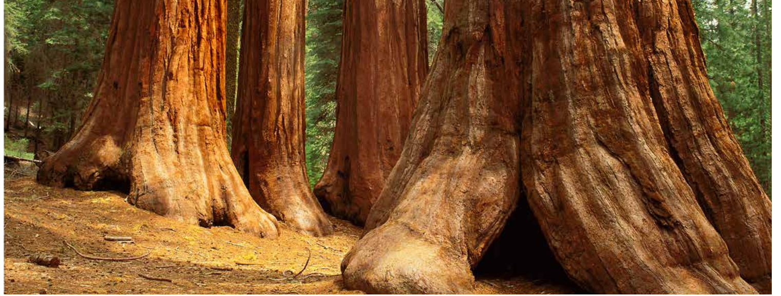
Mariposa Grove of Giant Sequoias.