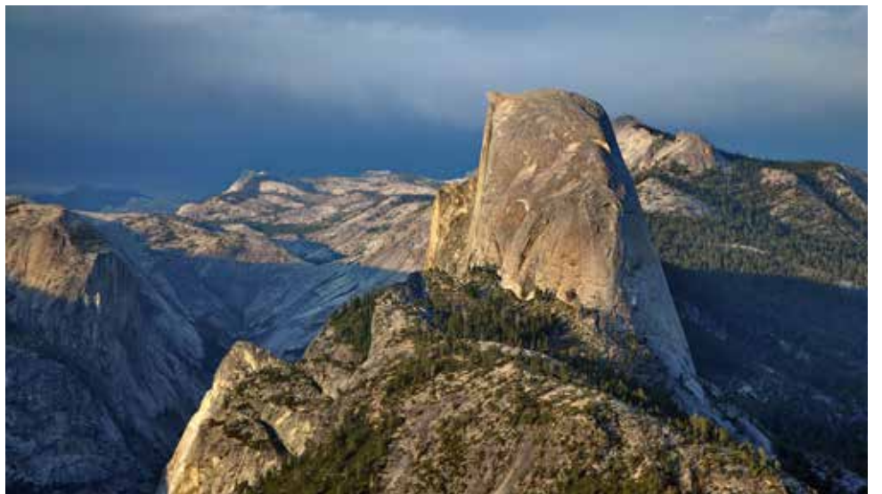
Half Dome view from Glacier Point.