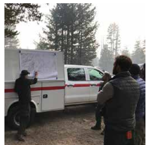
Every prescribed fire and wildfire is managed with careful strategic planning.