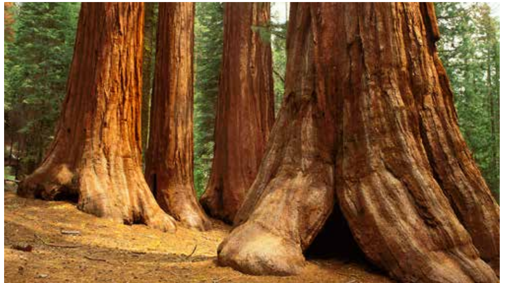
The Mariposa Grove.