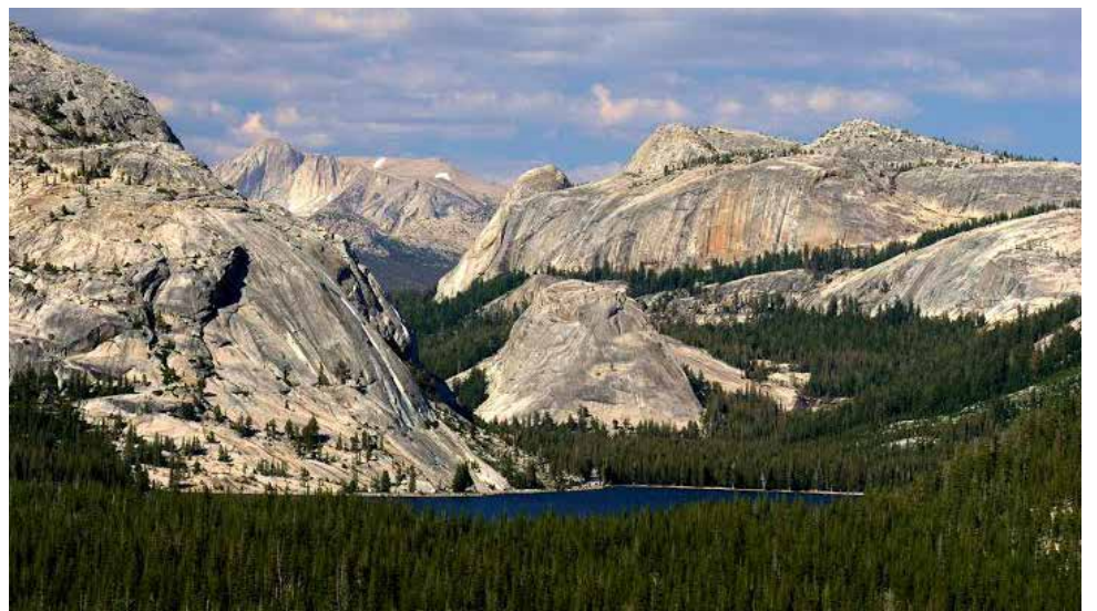
Tenaya Lake.