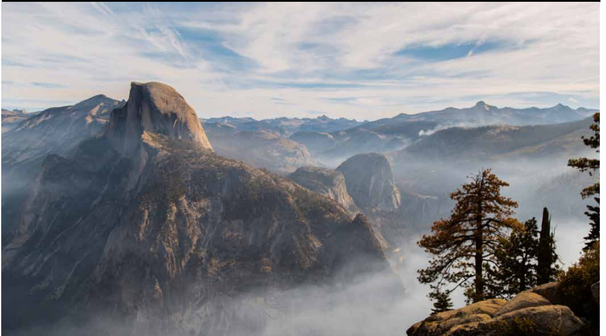
Smoke from the 2017 Empire Fire drifts around Half Dome. Read about how fire plays an important role in Yosemite on page 10 .

Experience Your America Yosemite National Park