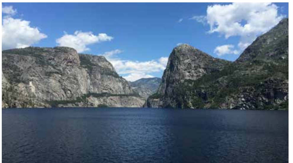
Hetch Hetchy.