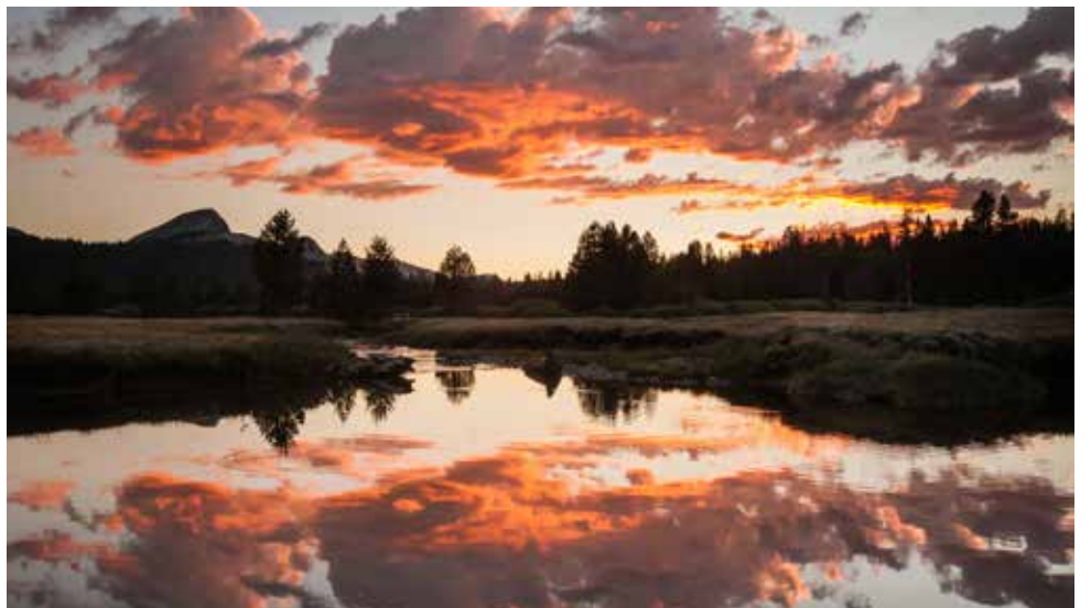
Tuolumne River at Tuolumne Meadows.