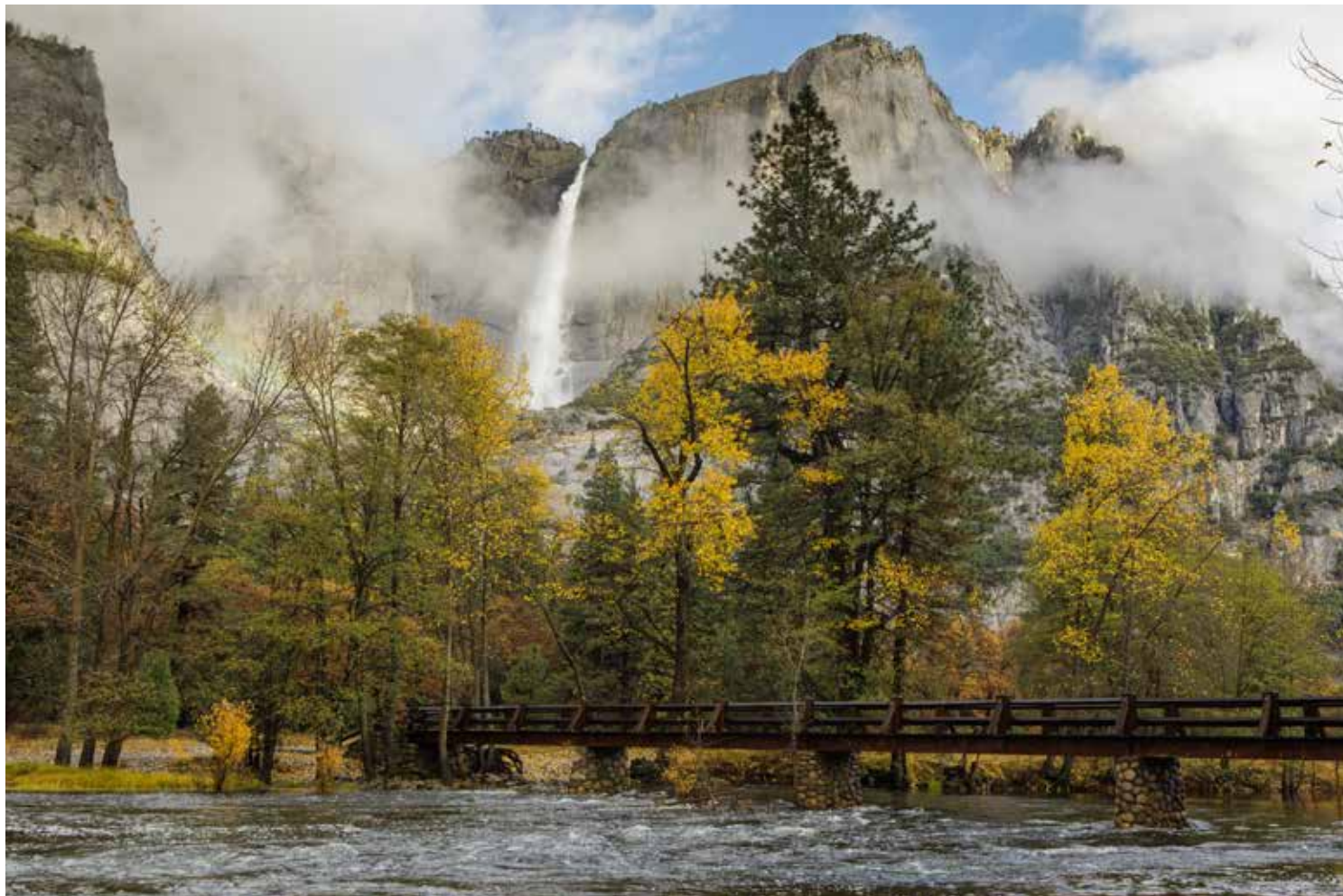
A fall day in Yosemite Valley.