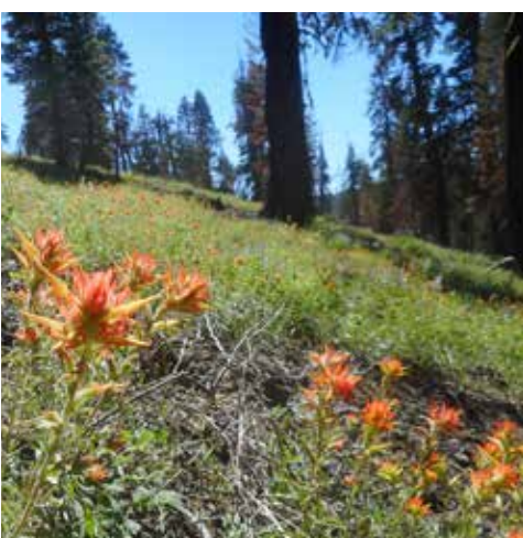
A Fire Follower - Applegate's Paintbrush, one year after 2017 Empire Fire.

While you take in the beauty of Yosemite, we hope you'll commit to practicing fire safety. If you're planning on camping, make sure you understand current fire rules and restrictions. If you have a campfire or charcoal grill (where they are permitted), follow a few simple rules: never leave your fire unattended, always clear around your fire ring, and ensure your fire is out cold by using the “drown, stir, and feel” method, before leaving the fire ring.