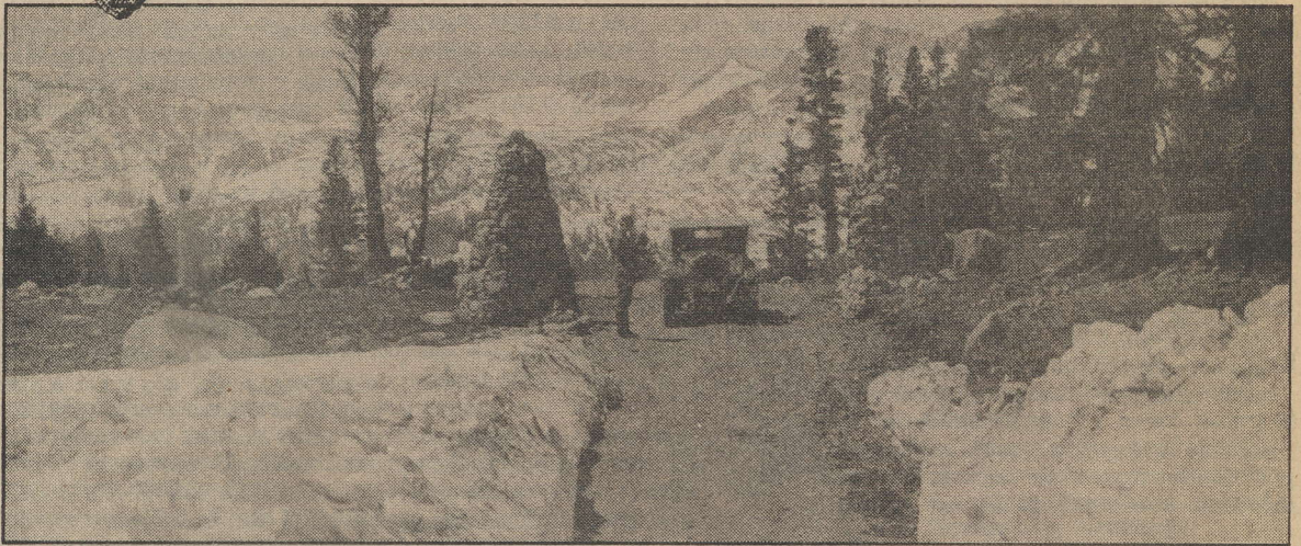
Tioga Pass Entrance Station, 1923. As the story below relates, 190 cars entered the park through this entrance station in 1916, the year it opened. In 1982, 439,262 people in 151,470 vehicles were checked through. At an elevation of 9945 feet, Tioga is the highest pass across the Sierra.