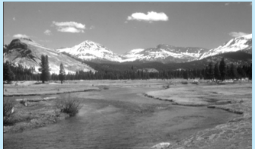
Tuolumne Meadows looking east to Lembert Dome and beyond to Mt. Dana and Mt. Gibbs.

Open daily 8:00 a.m. to 5:00 p.m. (closed 1 hr. for lunch). From October 15 through Tioga Road closure, self-registration on the porch of the Tuolumne Meadows Wilderness Center. Prior to October 21, Half Dome trips must get permits at the Yosemite Valley Wilderness Center. Located just off the Tioga Road, along the roadway leading to Tuolumne Lodge. Trail information, wilderness permits, bear canister rentals, maps, and guidebooks available. ♿