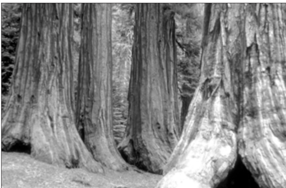
Mariposa Grove of Giant Sequoias