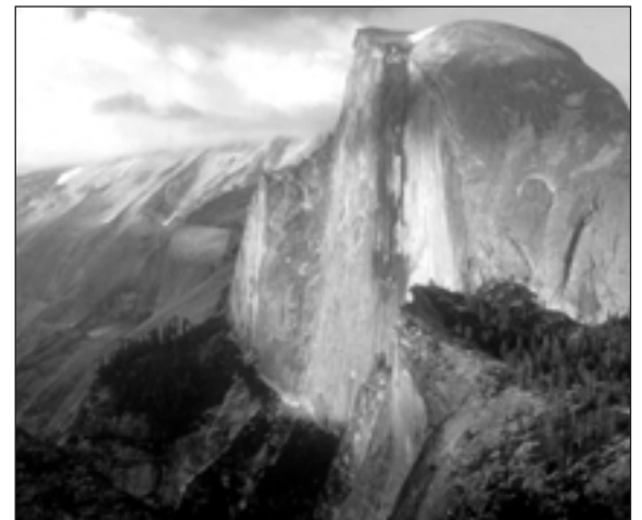
Half Dome from Glacier Point