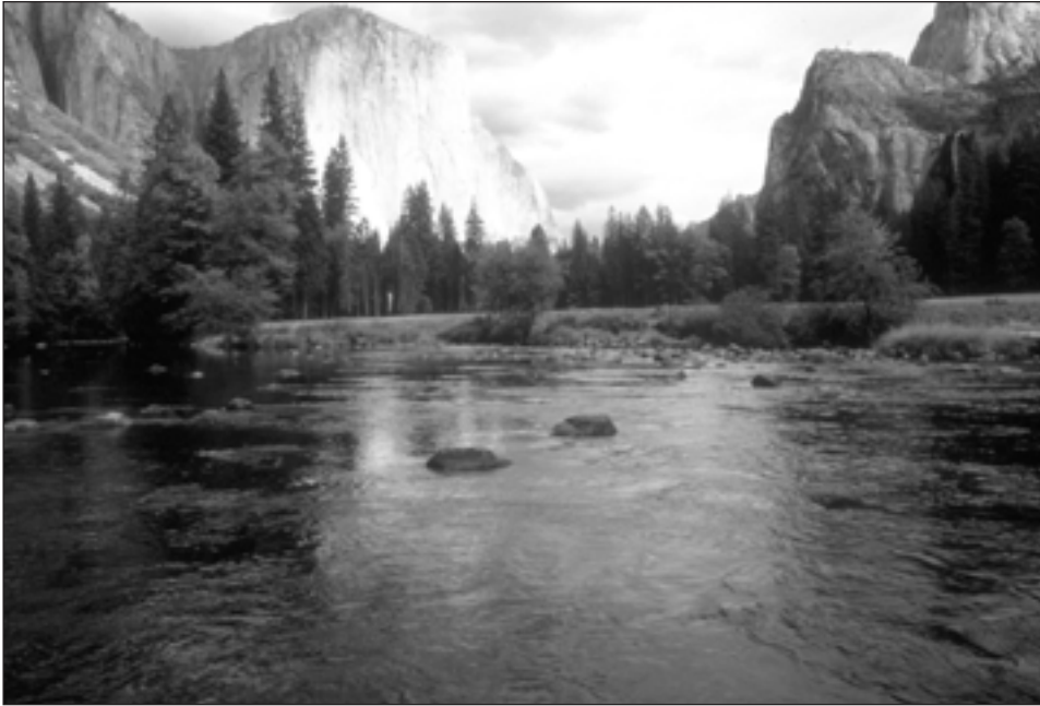
Yosemite Valley View