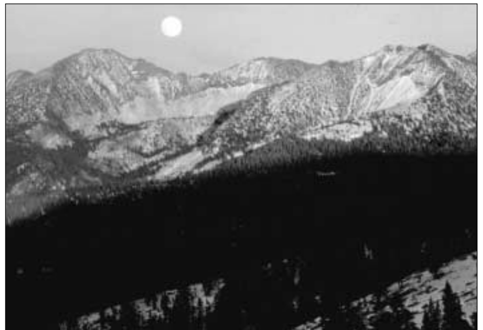
Full moon over Mt. Clark.

Wawona Community Center Worship Service Sunday 9:00 a.m. Women's Bible Study Wednesday 1:00 p.m.