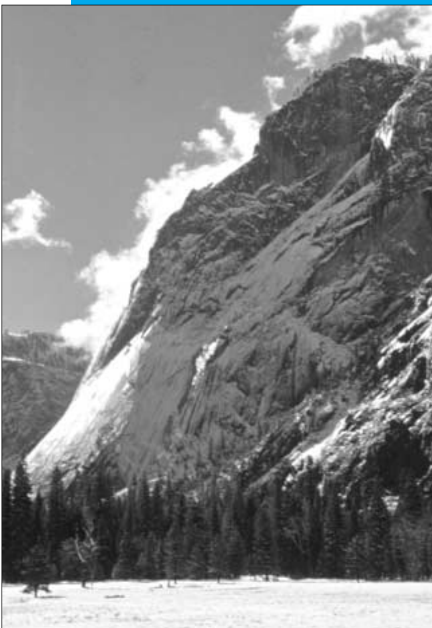
Above: Glacier Point Apron as seen from Yosemite Valley.