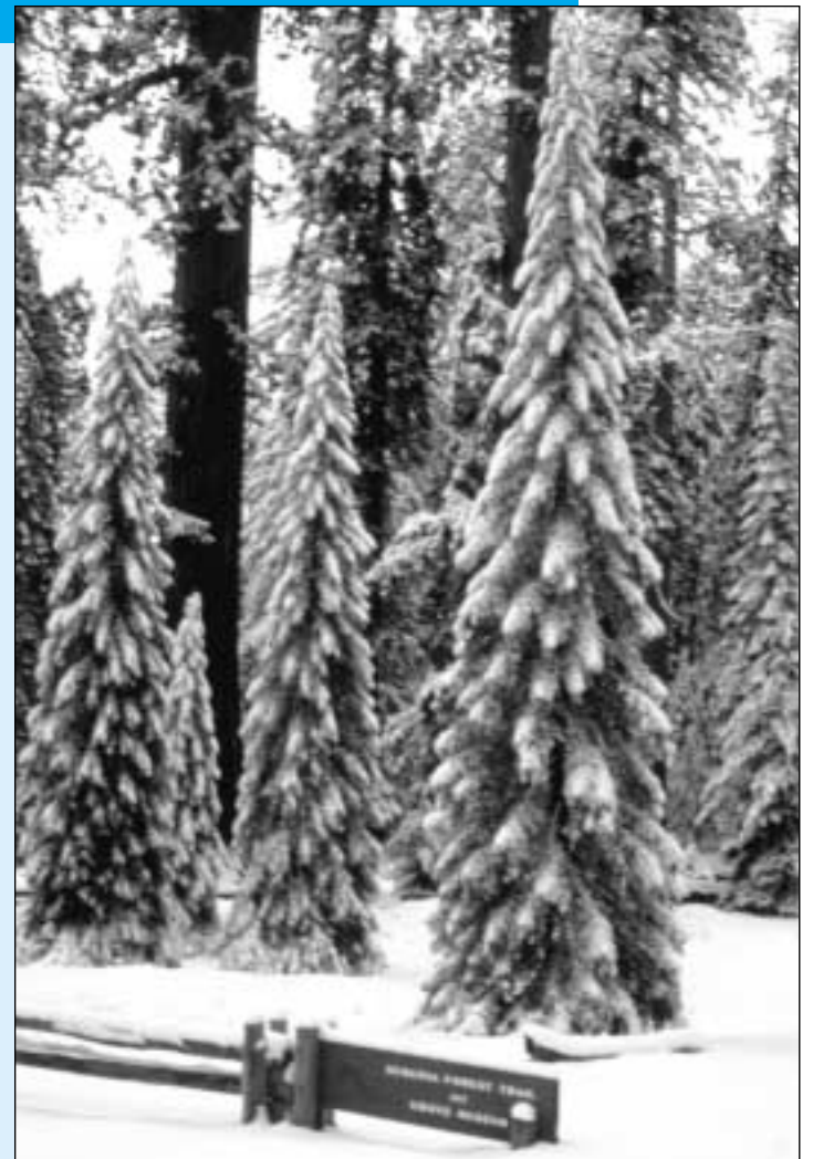
Mariposa Grove of Giant Sequoias

The Tuolumne Grove of Giant Sequoias is near Crane Flat at the intersection of the Big Oak Flat Road and the Tioga Road. The former route of the old Big Oak Flat Road leads downhill from Crane Flat into the Tuolumne Grove, a cluster of about 25 sequoias. Now closed to cars, this 2-mile round-trip walk is relatively easy, depending on conditions; however, it is moderately strenuous on the uphill return.