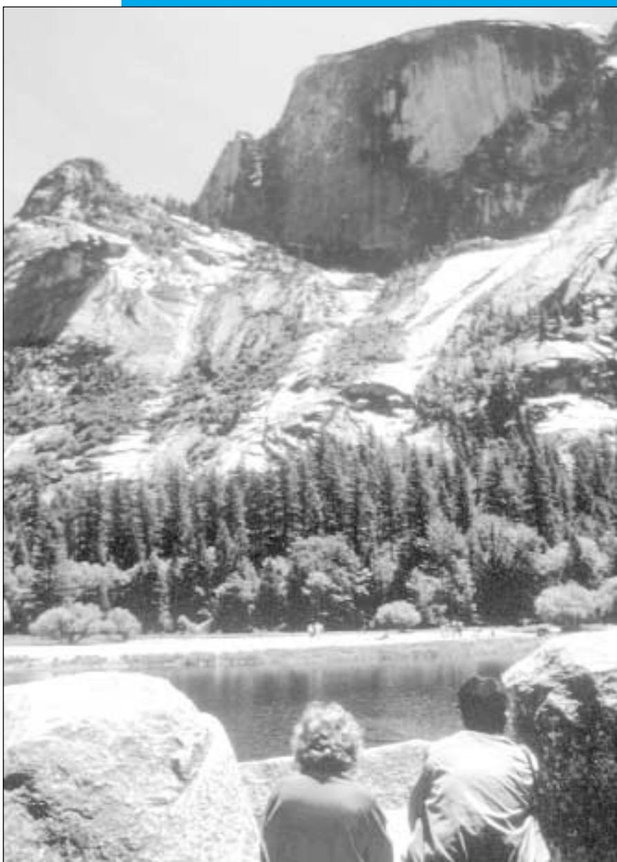
Half Dome at Mirror Lake