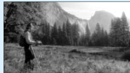
"Spirit of Yosemite"—a new state-of-the-art visitor orientation film

Open daily 9:00 a.m. to 5:00 p.m. Located in Yosemite Village just west of the main post office (shuttle stops #5 and #9). Information, maps, books, exhibits, and a multilingual One Day in Yosemite program. Wilderness permits available by self-registration. &