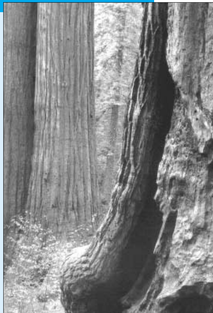
Mariposa Grove of Giant Sequoias

The Tuolumne Grove of Giant Sequoias is near Crane Flat at the intersection of the Big Oak Flat Road and the Tioga Road. The former route of the old Big Oak Flat Road leads downhill from Crane Flat into the Tuolumne Grove, a cluster of about 25 sequoias. Now closed to cars, this 2-mile round-trip walk is relatively easy, depending on conditions; however, it is moderately strenuous on the uphill return.