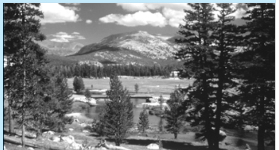
Mammoth Peak as seen from Soda Springs in Tuolumne Meadows

Service begins at Tuolumne Meadows Lodge at 7:00 a.m. Shuttle buses arrive at approximately 30-minute intervals between 8:30 a.m. and 5:30 p.m. The last shuttle bus leaves Olmsted Point at 6:30 p.m. Schedules are subject to change. Please check route maps at the Tuolumne Meadows Visitor Center or shuttle bus stops for details.