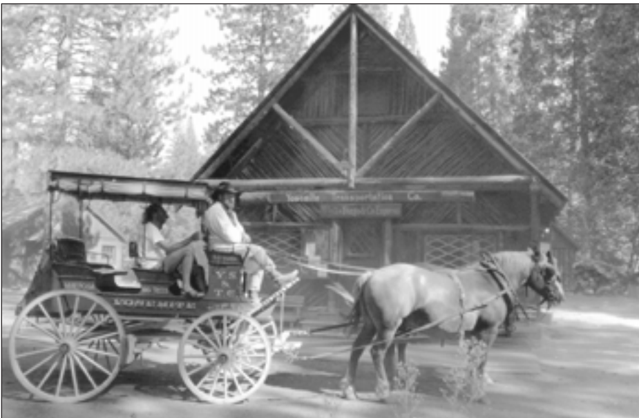
Visit the Pioneer Yosemite History Center in Wawona.