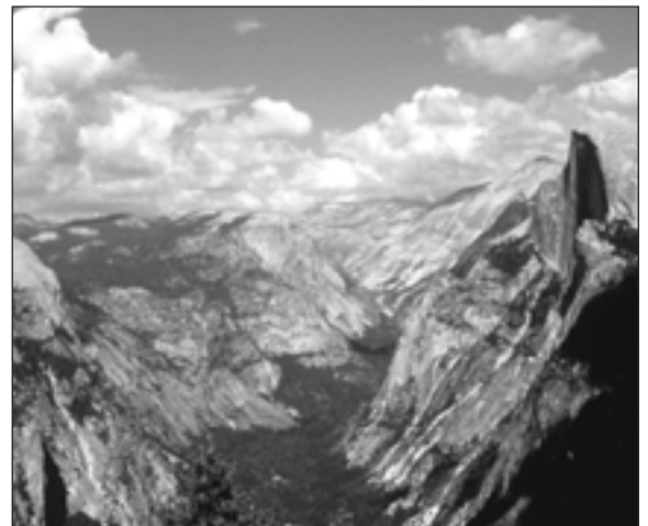
Half Dome, North Dome, and Tenaya Canyon as seen from Glacier Point