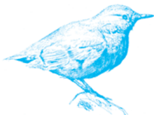
American Dipper Illustration by Lawrence Ormsby

Open 8:00 a.m. to 5:00 p.m. Located in Yosemite Village between The Ansel Adams Gallery and the post office. One-stop resource for backpackers in need of wilderness permits, bear canisters, maps, and guidebooks. Displays and information on pre-trip planning, minimum impact camping techniques, and Yosemite's wilderness. ♿