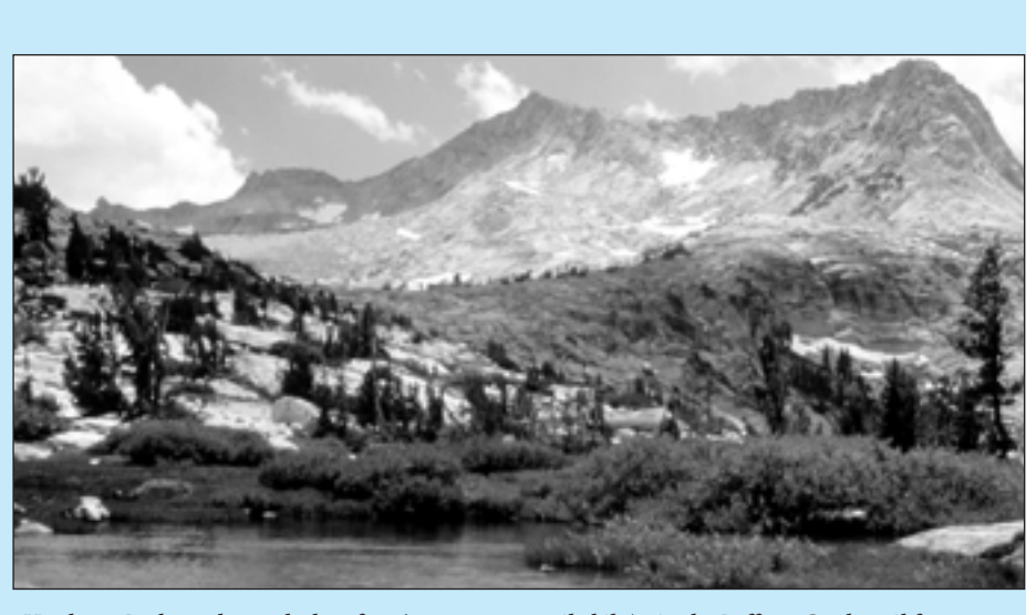
Vogelsang Peak can be reached on foot (a strenuous 8 mile hike) via the Rafferty Creek trail from Tuolumne Meadows. The Vogelsang High Sierra Camp can be reached 6 miles in on the same trail.

Indicates facilities accessible for visitors in wheelchairs, with assistance.