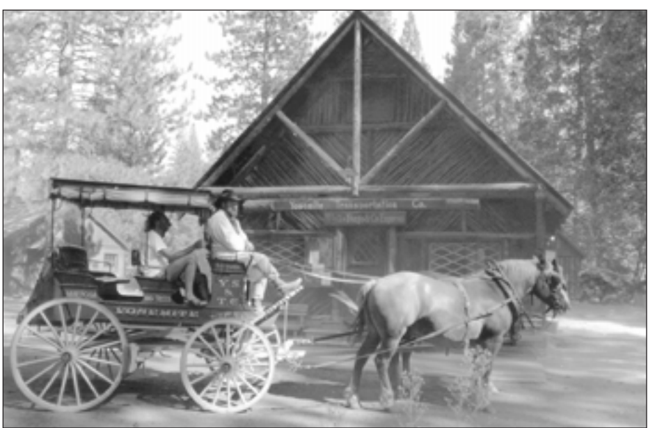
Visit the Pioneer Yosemite History Center in Wawona.

Indicates facilites accessible for visitors in