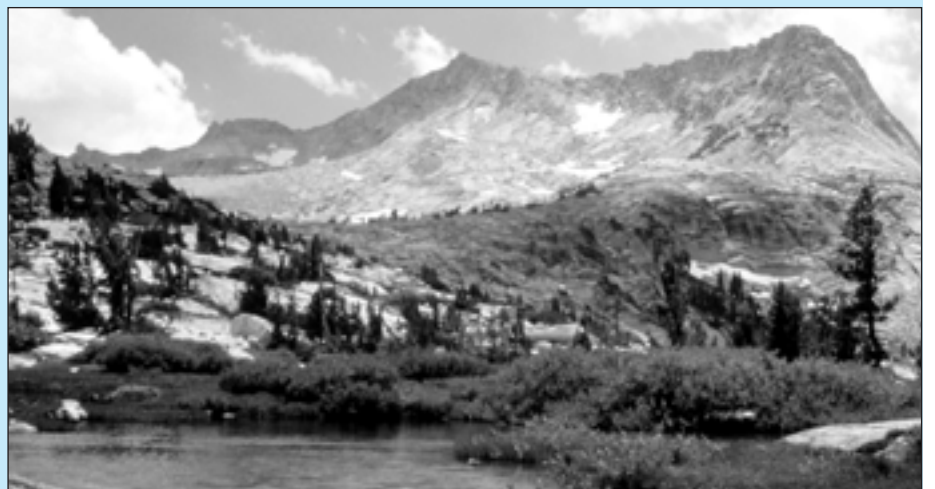
Cathedral Peak from Cathedral Lake

Service begins at Tuolumne Meadows Lodge at 7:00 a.m. Shuttle buses arrive at approximately