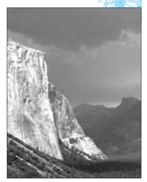
El Capitan from Tunnel View.*

A Changing Yosemite is a 1-mile trail that begins in front of the Visitor Center, near shuttle