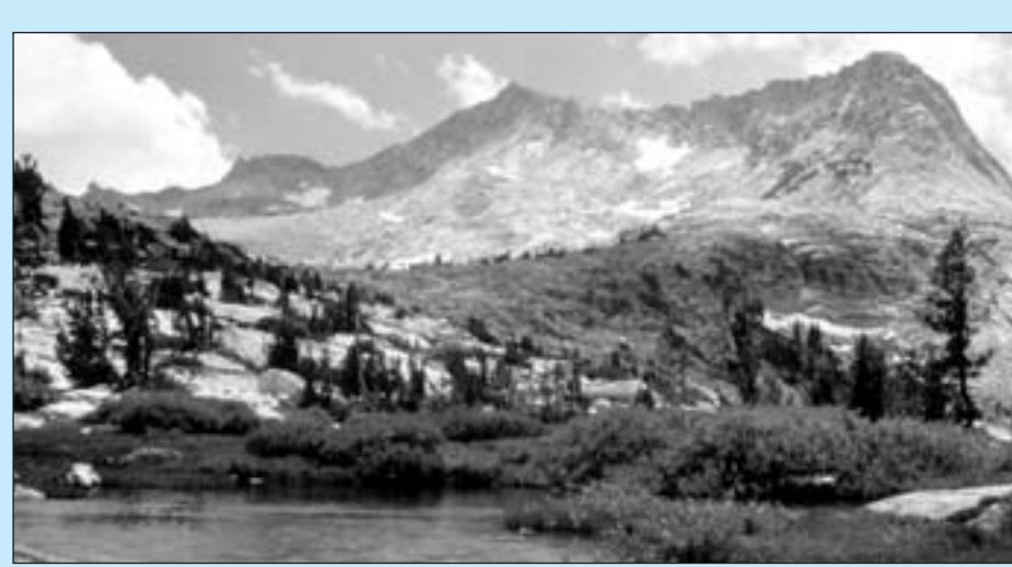
Cathedral Peak from Cathedral Lake

Indicates facilities accessible for visitors in wheelchairs, with assistance.