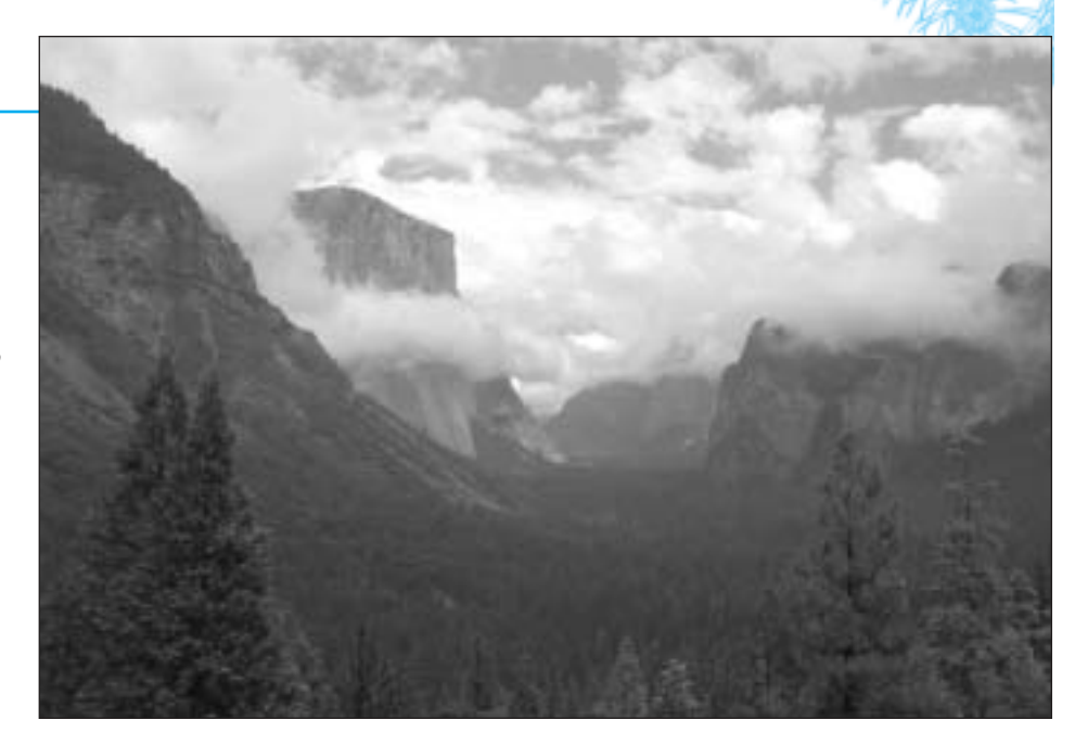
Tunnel View After a Storm*

Come help Yosemite Theater Live celebrate its 19th season! The National Park Service recognizes Yosemite Theater as the best interpretive program