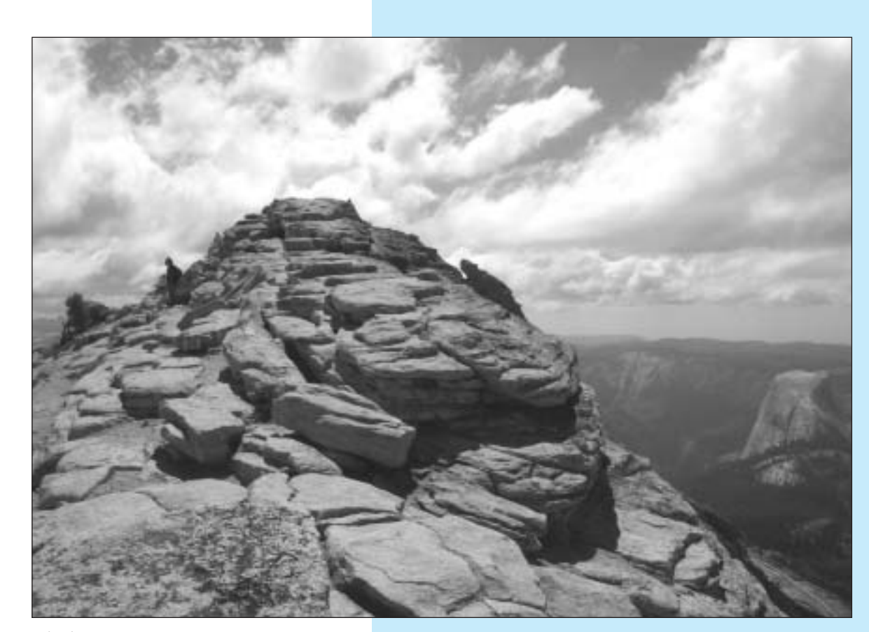
Clouds Rest Summit*