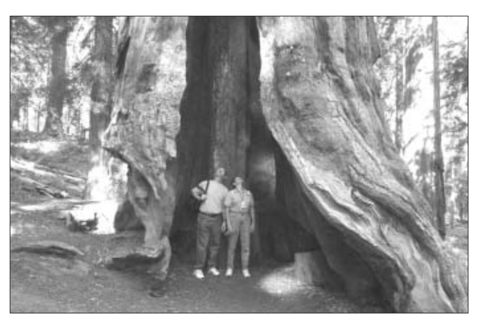
Inside the Telescope Tree*

Indicates facilites accessible for visitors in