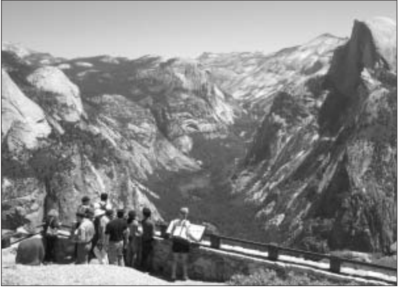
View from Glacier Point*