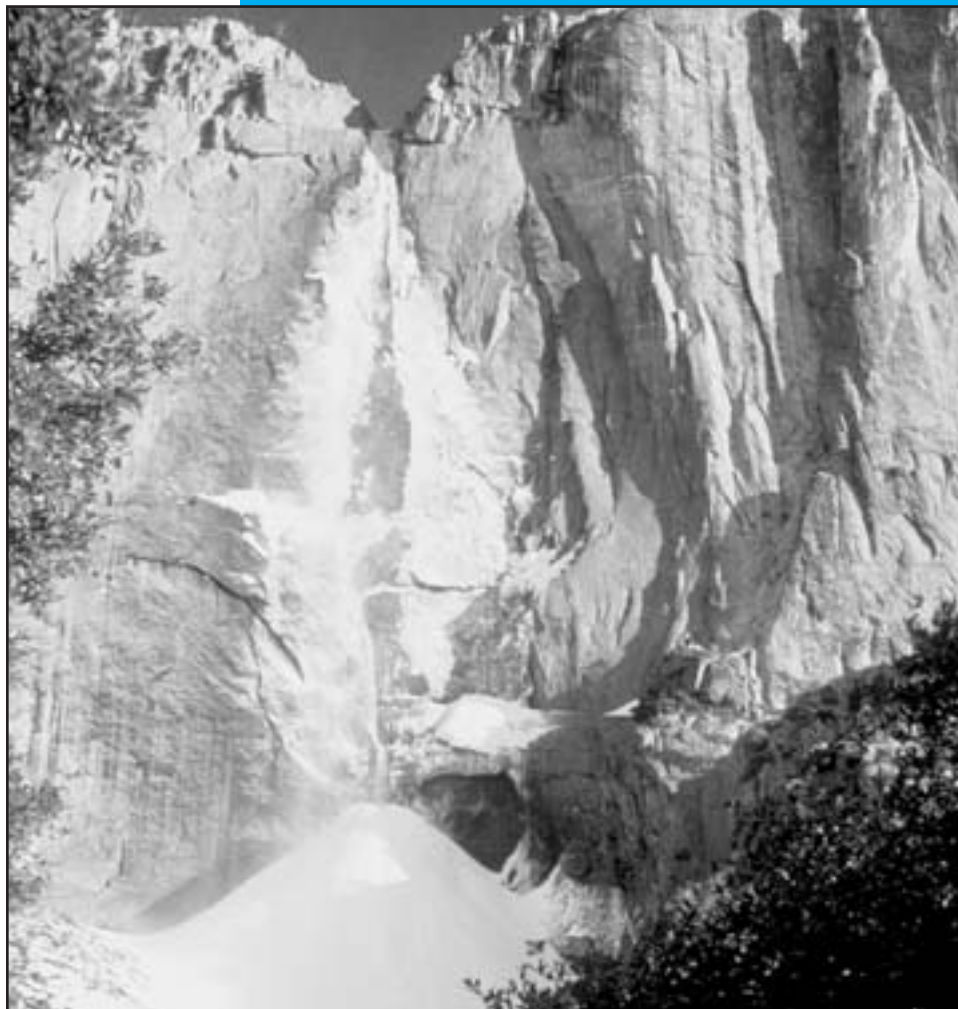
Upper Yosemite Fall and ice cone