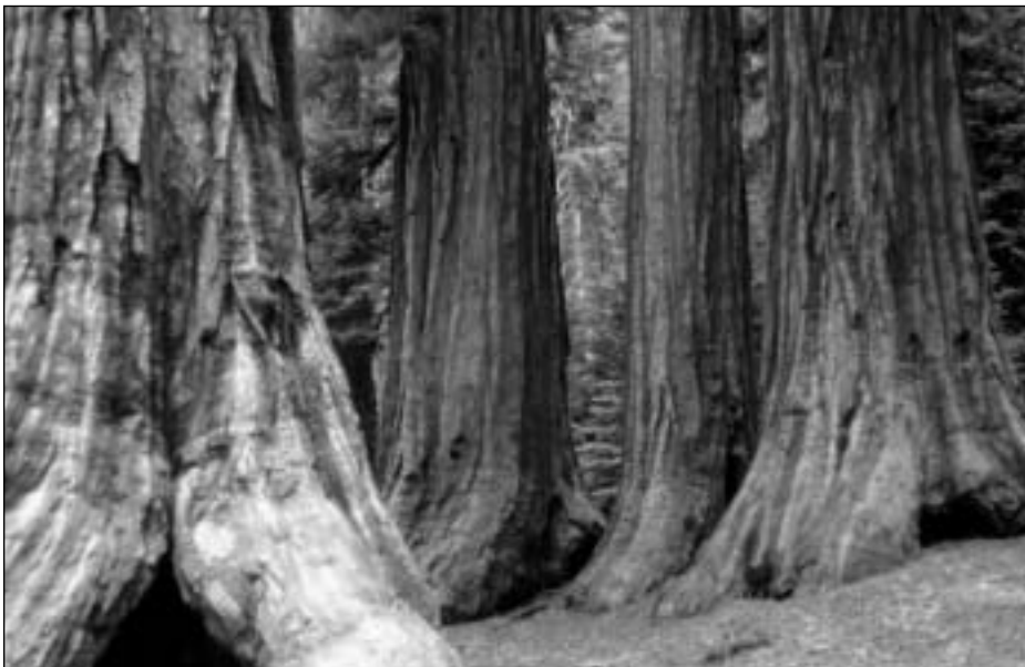
Bachelor and Three Graces