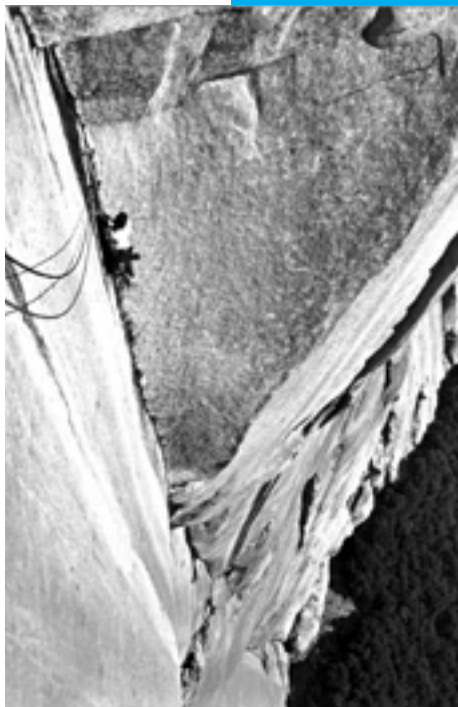
The Dihedral Wall, El Capitan - 1962