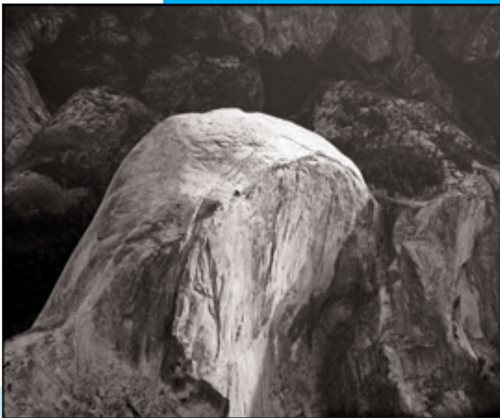
Half Dome Overview