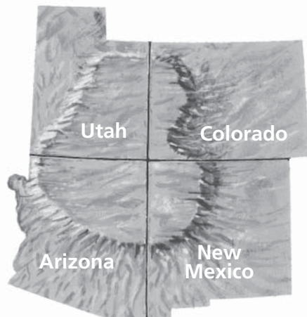
The Colorado Plateau

Volcanic vents, created as a result of the weakening of the Earth's crust during uplift, allowed lava flows and cinder cones to form. Cinder was piled several hundred feet high in classic cone shapes and lava flowed into valleys. Cinder cones and black basalt flows are visible west of Rockville and on Kolob Terrace.