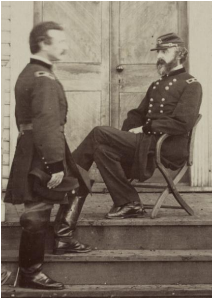
General George G. Meade, with chief of staff Gen. A.A. Humphreys, sits for a portrait two months after the close of the Gettysburg Campaign.