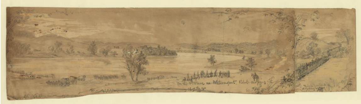
Panorama of Falling Waters , Maryland, with Confederate troops crossing the Potomac River, sketched by Alfred Waud. (LOC)

Meade’s failure to exercise decisive leadership, including his decision to acquiesce to his subordinates at the July 12 th council of war, resulted in critical strategic implications. Lincoln and Halleck immediately expressed displeasure with Meade’s caution. That afternoon, Halleck telegraphed Meade ordering the general to initiate an “energetic pursuit” and noting Lincoln’s “dissatisfaction” with Meade’s strategic situation. In turn, Meade, frustrated with the seemingly unrealistic objectives of Halleck and the Lincoln administration, caustically responded ninety minutes later by asking to be relieved of command. Halleck denied the general’s request and again prodded Meade into an “active pursuit.” Two days following the events at Williamsport, and still seething from the telegrams out of Washington, Meade shared the burdens of command with his wife. “No man who does his duty,” Meade wrote, “and all that he can do, as I maintain I have done, needs spurring .” Constrained by the weakened condition of his army, Meade articulated annoyance with being “urged, pushed and spurred to attempting to pursue and destroy an enemy nearly equal to my own.” 25