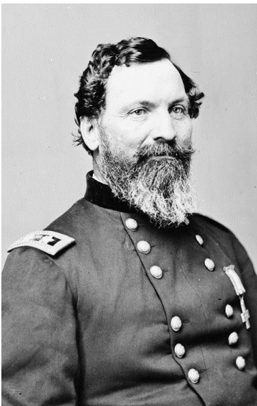
Major General John Sedgwick, reliable commander of the Sixth Corps that led the pursuit from Gettysburg.

As the curtain closed on the deadliest battle of the American Civil War, Meade considered his next strategic step. Victory at Gettysburg came at a high cost. After three days of grueling fighting, the Army of the Potomac suffered approximately 23,000 casualties. Among those included critical losses in the Union high command, including the death of 1 st Corps commander Major General John Fulton Reynolds and the wounding of 2 nd and 3 rd Corps commanders, Major General Winfield Scott Hancock and Major General Daniel Sickles. On July 4 th , as Lee's army prepared its retreat from Seminary Ridge, Meade gathered his generals for a council of war. Here they explored the efficacy of a pursuit and the suggested route. The commanding general reiterated his strategic objective remained the protection of Washington and Baltimore, per Lincoln's instructions given at the outset of the campaign. Several questions guided the conversation. First, the generals considered whether the army should remain in Gettysburg. Then they debated the feasibility of an offensive. Third, the generals then explored the line of pursuit, via Williamsport and Emmitsburg. 4 With the consensus from his subordinate commanders, Meade ordered the bulk of units to remain in a defensive posture at Gettysburg. Here lay the first missed opportunity of the pursuit. In remaining idle, Meade missed the first step of a relentless pursuit, passing the strategic initiative to the Confederates.