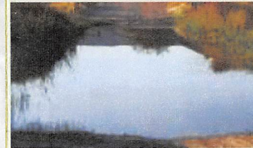
Mojave River Water Crossing