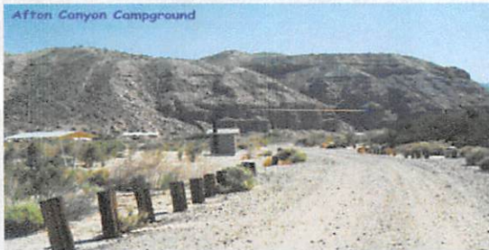
Afton Canyon Campground

Afton Canyon Natural Area is located 37 miles northeast of Barstow along Interstate 15 between the Afton Road and Basin Road exits. Afton Canyon is designated as an Area of Critical Environmental Concern to protect plant and wildlife habitat, and to preserve scenic values of the riparian area within the canyon. Early western explorers passing through this area included Jedediah Smith, Kit Carson and John Charles Fremont. The route following this road known as the Mojave Road, is a rugged 4-wheel-drive scenic tour running from Fort Mojave on the Colorado River Near Needles to Camp Cady near Harvard Road east of Barstow.