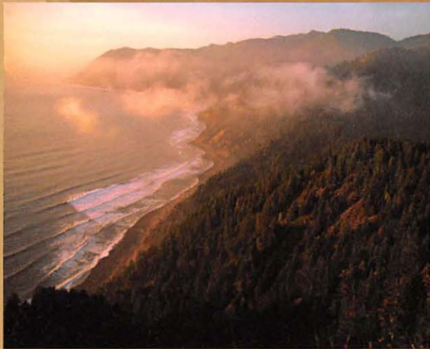
King Range, California