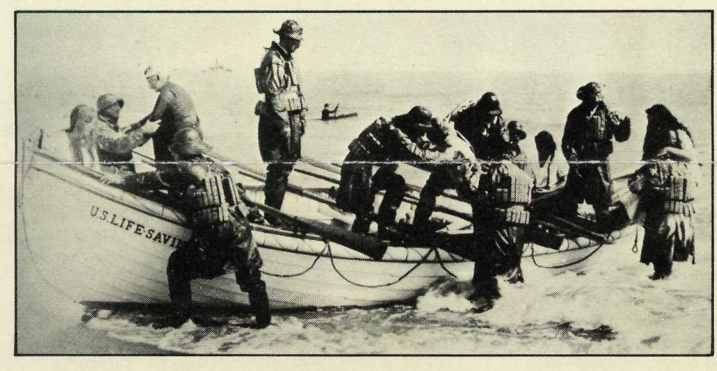
Nineteenth century island rescue crews returned shipwreck survivors to safety in small oar-powered boats. Today the U.S. Coast

many Allied tankers and cargo ships here that these waters earned a second sobering name-Torpedo Junction. In the past 400 years the graveyard has claimed many lives. But many were saved by island villagers. As early as the 1870s villagers served as members of the U.S. Life Saving Service. Others manned lighthouses built to guide mariners. Later, when the U.S. Coast Guard became the guardian of the nation's shores, many residents joined its ranks. When rescue attempts failed, villagers buried the dead and salvaged shipwreck remains. Today few ships wreck, but storms still uncover the ruins of old wrecks that lie along the beaches of the Outer Banks.