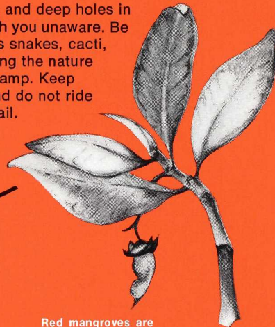
Red mangroves are land makers. Their roots trap drifting plantlife and soil particles thereby inching the land forward into the shallow water.

Do not be lured by the natural setting into doing something foolish, for inherent dangers are here. Sharp shells and barnacles can cut your feet while wading, and deep holes in the river may catch you unaware. Be alert for poisonous snakes, cacti, and poison ivy along the nature trail and in the swamp. Keep pets on a leash and do not ride bicycles on the trail.