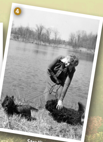
4 Strolling by the pond with her companions.