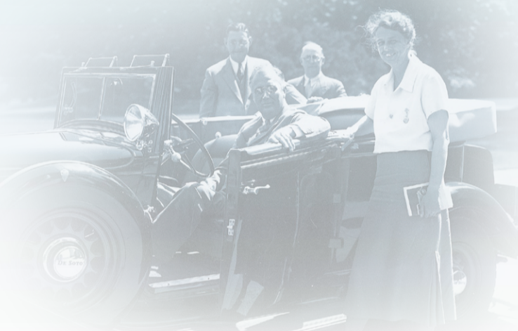
With FDR, 1933, in their presidential years. FOR PRESIDENTIAL LIBRARY

1927-29 ER, Nancy Cook, and Marion Dickerman discuss FDR's concern for national trend of farmers leaving rural areas for city jobs. Cook suggests Val-Kill furniture cottage industry to employ local farmers in slack season; master cabinetmakers teach skills in shop/factory built behind cottage. Forge built to make pewter items; weaving shop creates jobs for women. ER markets products.