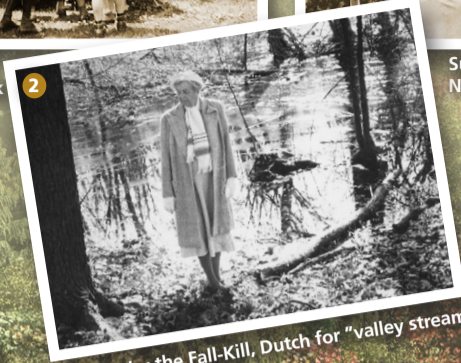
2 Standing by the Fall-Kill, Dutch for "valley stream."