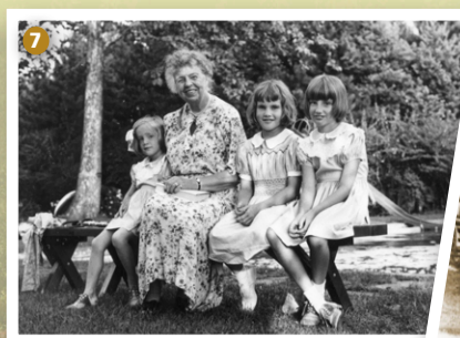
7 Reading to her granddaughters.