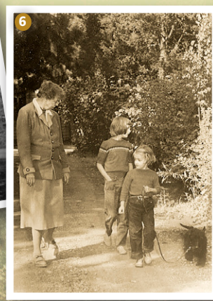
6 Walking with her granddaughters.