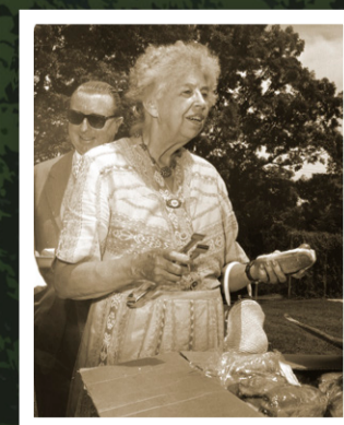
Serving hot dogs at one of her picnics (left).