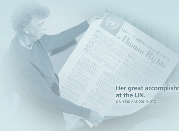
Her great accomplishment, at the UN.

1949-51 At Val-Kill, French President Auriol decorates ER as Commander of the Order of the Legion of Honor. ER hosts Prime Minister Nehru of India.