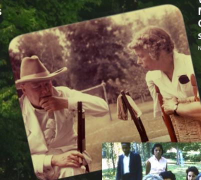
With British Prime Minister Winston Churchill (left) and students (below).

When her husband contracted polio and was unable to walk unaided, Eleanor helped FDR get back into public life. She traveled widely, in New York state when he was governor and later across the nation when he was president. She researched and investigated problems needing his executive attention. FDR benefited greatly from her humanitarian and social justice commitments. She faced criticism and threats for her stands on racial justice and other sensitive social issues. She continued this work throughout her life and became one of the most beloved figures of her time.