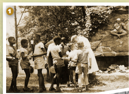
1 Hosting students from the Wiltwyck School.