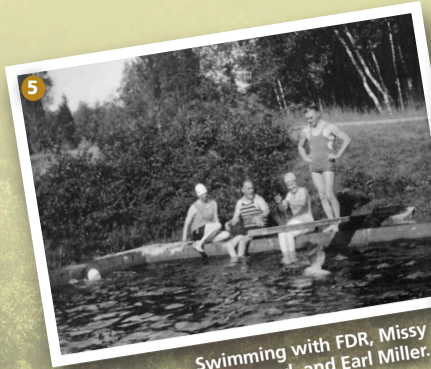
5 Swimming with FDR, Missy LeHand, and Earl Miller.