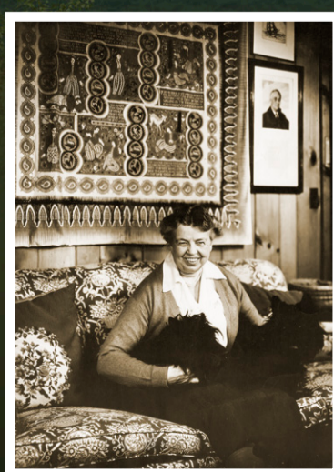
Eleanor Roosevelt at Val-Kill, 1948.

Welcome to Eleanor Roosevelt's home. Relax in the serenity of the gardens and woodland trails. See the film "Close to Home" in the Playhouse. Explore the grounds—outbuildings, swimming pool, and Val-Kill pond—where family, friends, and dignitaries were entertained. Tour Val-Kill Cottage and Stone Cottage to experience the home of the most prominent American woman of her time.