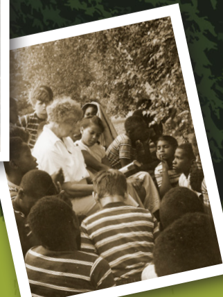
First Lady of the World (right); with Wiltwyck School boys (below left). FOR PRESIDENTIAL LIBRARY