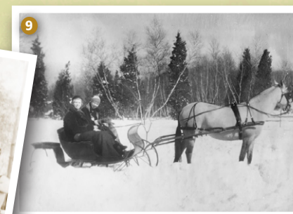
9 Sleighing with daughter Anna.