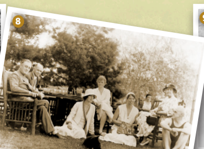
8 Friends and associates join FDR and ER for picnic at Val-Kill.