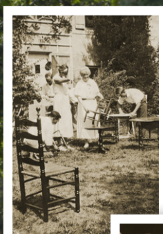
Craftsmen working at Val-Kill Industries and trademark. FOR PRESIDENTIAL LIBRARY