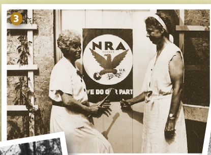
3 Supporting the New Deal's National Relief Agency.