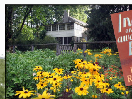
She wrote 27 books, many at her Val-Kill home.

1984 Eleanor Roosevelt National Historic Site dedicated and opened to the public.