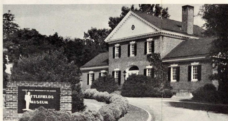
FREDERICKSBURG VISITOR CENTER