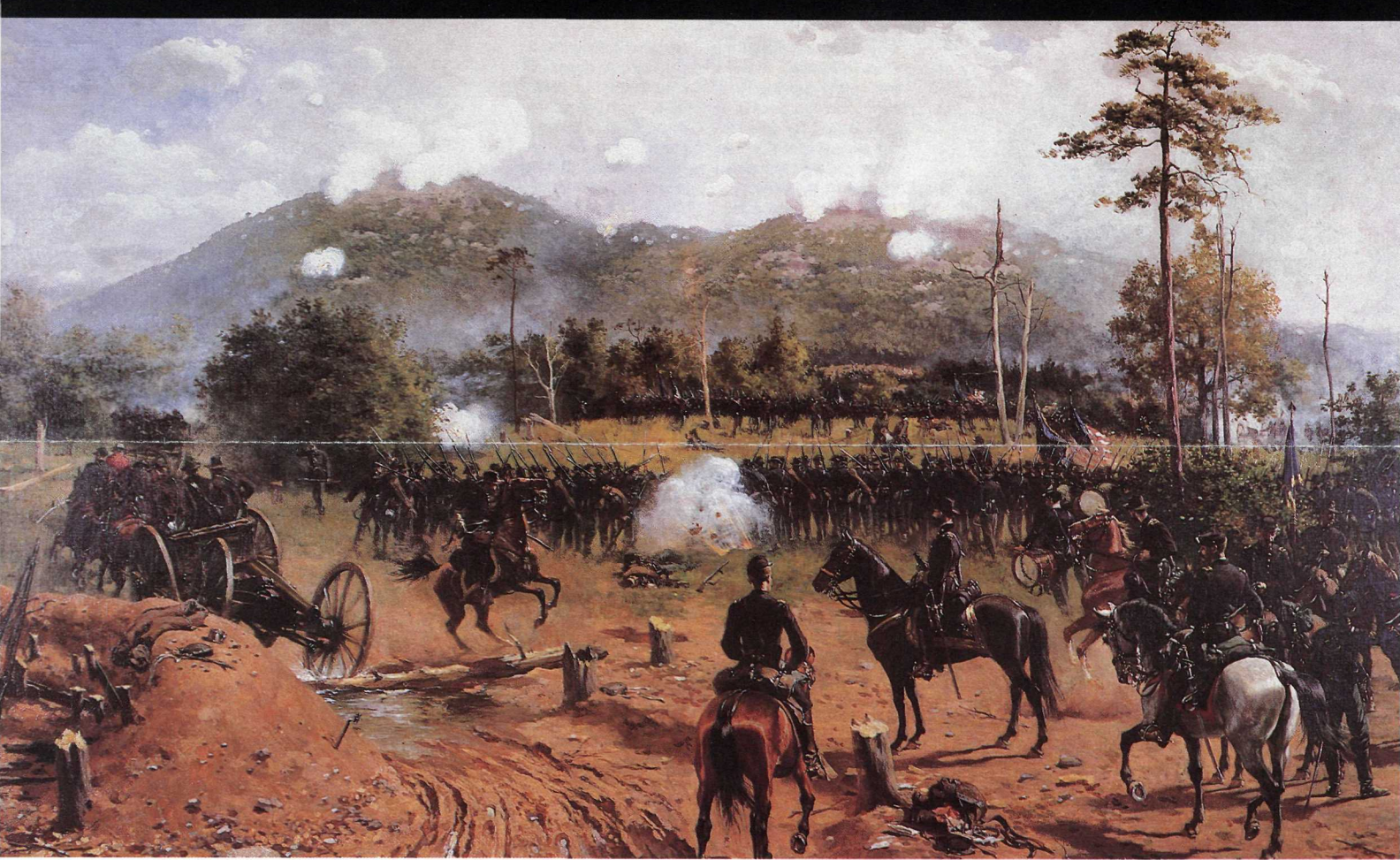
The Battle of Kennesaw Mountain, by Thure de Thulstrup.

National Park Service U.S. Department of the Interior