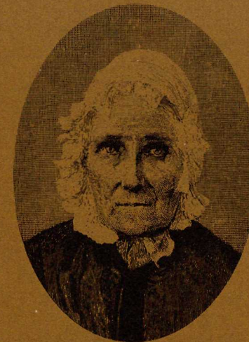
Sarah Bush Johnston Lincoln, 1788-1869

"There was absolutely nothing to excite ambition for education," he said later of his schooling in Indiana. Still, there emerged a love of reading and a curiosity for knowledge that lasted a lifetime. The Bible , Aesop's Fables , Pilgrim's Progress , Robinson Crusoe , Franklin's Autobiography , the classics of the day, were the books he mastered. The boy had a good memory and a ready wit. Laying aside his work, he would often entertain friends with jokes and imitations of politicians and preachers—the pillars of the community. And down the