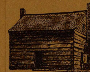
Little Pigeon Baptist Church

Piling all their goods into three wagons, the Lincoln family pulled slowly away from the homestead, picked up the road to Vincennes about 6½ kilometers (4 miles) north, and plodded steadily toward Illinois. On March 6 the caravan crossed the Wabash, and within the month they came to the north bank of the Sangamon River 13 kilometers (8 miles) west of Decatur. Abraham Lincoln, product of the Kentucky hills and Indiana forests, had reached the prairie country that would claim his next 30 years.