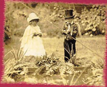
Costumed children at play circa 1912 during one of numerous lawn parties held for the neighborhood's predominately immigrant families.

Proceeds from admission fees and purchases made at this historic site benefit social services at The House of the Seven Gables Settlement. Founded in 1908, the Settlement continues to provide educational and social activities for children and senior citizens