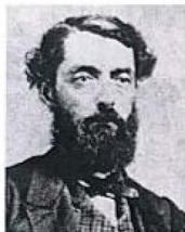
Edwin L. Drake

Drake Well Museum and Park shows how the world changed forever after Edwin L. Drake drilled his well in 1859 and launched the modern oil industry. This historic site chronicles how the industry grew as kerosene for lamps and lubrication for industrial Revolution machinery were refined from Pennsylvania's paraffin-based crude oil. Today, the petroleum industry is global,