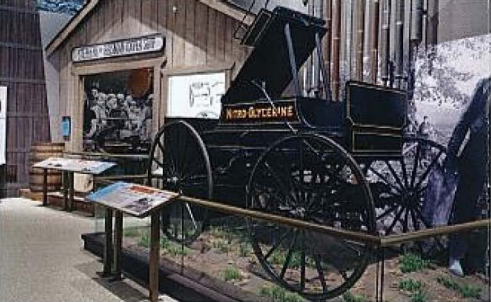
The Nitro Wagon in the Producing Oil Exhibit illustrates one of the early oil industry's more dangerous jobs.