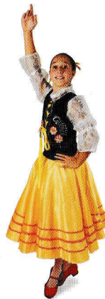
Dancing girl in a traditional costume.

For more information or to join online visit www.riversofsteel.com