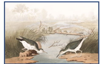
Bird illustrations by John James Audubon and courtesy of the National Audubon Society