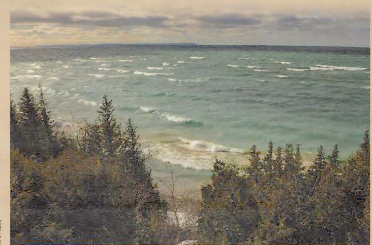
Water Wave action and currents continually shape Lake Michigan.

The bear's heart was broken, but she could do nothing. She waded ashore and climbed the bluff to lie down looking out on the water where her cubs had died. However both of them surfaced as two little islands. And so the bear still lies there now looking after her children.