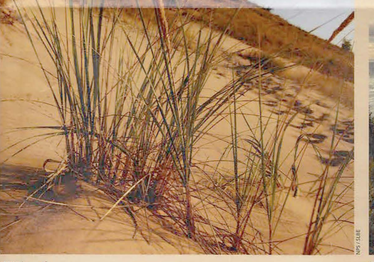
Wind Dune grass roots hold the sand in place, stabilizing and protecting the dune habitat for other species who live here. Help protect the fragile dunes by staying on designated trails.

Since that time, westerly winds, water, and weather continue to impact the land. Sometimes the change is gradual, but occasionally, storms transform the landscape