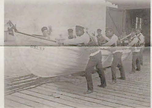
Surfboat and crew

You have to go out, but you don't have to come back. -motto, US Life-Saving Service