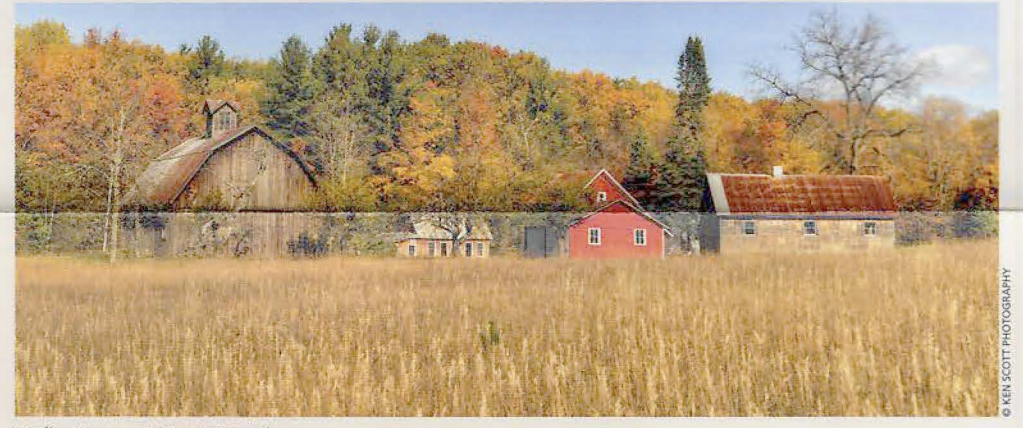
Bufka Farm at Port Oneida

Following the retreat of the last glaciers, prehistoric people were active in the area. They lived in seasonal camps fishing, gathering, hunting, and trapping. The Anishinaabe people were living here when Europeans arrived in the mid-1600s. In the early to mid-1800s, Europeans settled on the Manitou islands and later moved to the mainland.