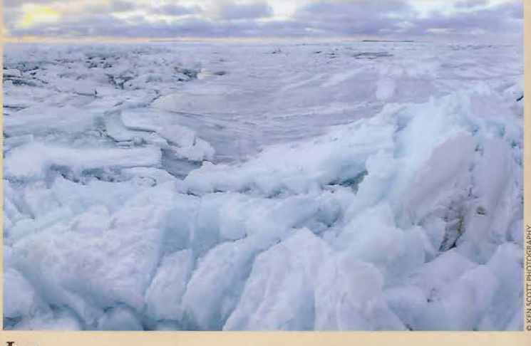
ICe Each winter nature's ice sculptures remind us of the continental ice sheets, which formed the Great Lakes and other features of Sleeping Bear Dunes National Lakeshore.

What encouraged you to come to Sleeping Bear Dunes National Lakeshore? The dunes? The lake? The forests? The wilderness? You may not have thought about it, but it was ice. Heavy, powerful, and up to a mile thick, glaciers advanced from the north over two million years ago. Creeping along like bulldozers, they moved rock and soil, gouging, carving, deepening, and widening