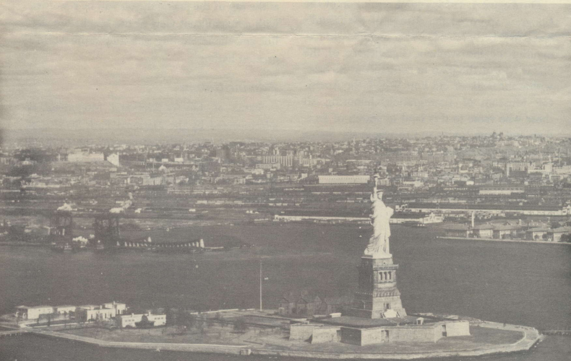
Air view of Statue of Liberty, with Jersey City in background.