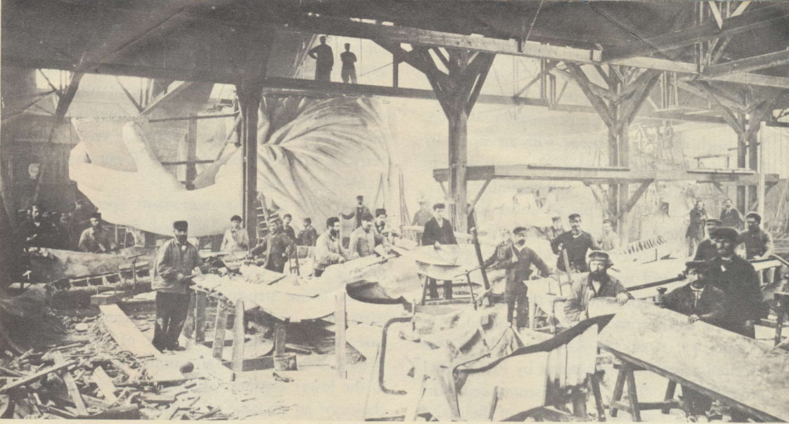
Sheet copper for the statue being hammered into shape in Paris workshop.