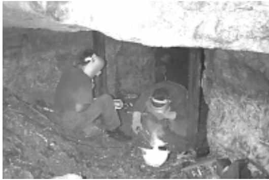
White Eagle #1 during early stages of gating.