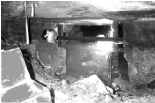
White Eagle #1 nearing completion