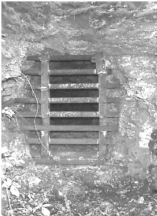
Lower McIntosh with completed gate.