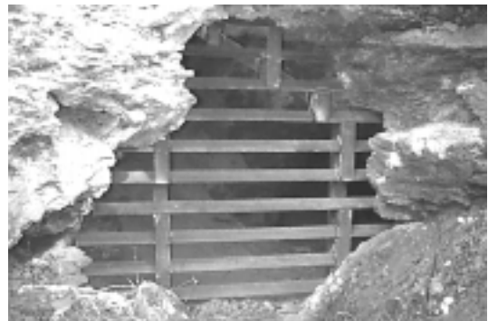
Monte Cristo #1 after gating