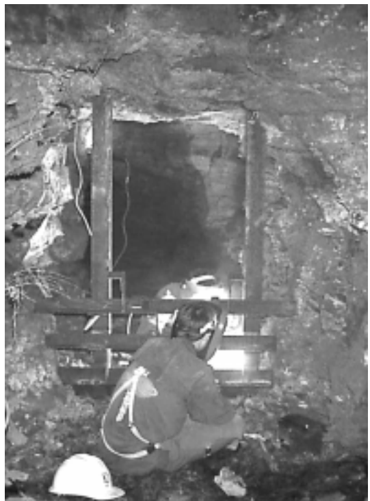
Lower McIntosh the afternoon of August 12.