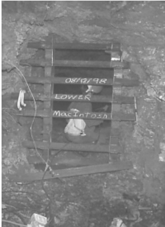
Lower McIntosh by the end of August