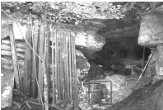
White Eagle #1, materials and equipment.