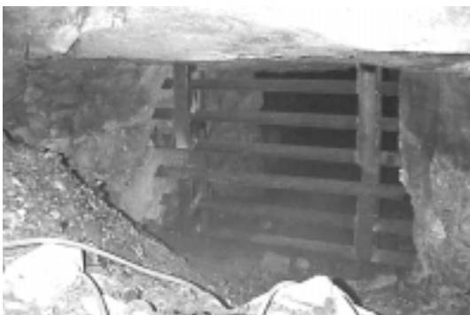
White Eagle #1 at completion