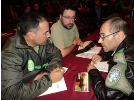
Pictured here are members of the Portuguese and Spanish Ranger Associations.