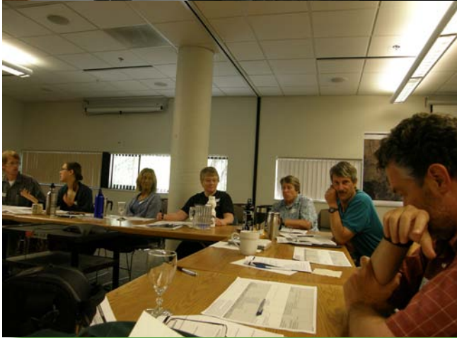
Participants discuss the Resource Stewardship Strategy components at workshops Lava Beds National Monument.