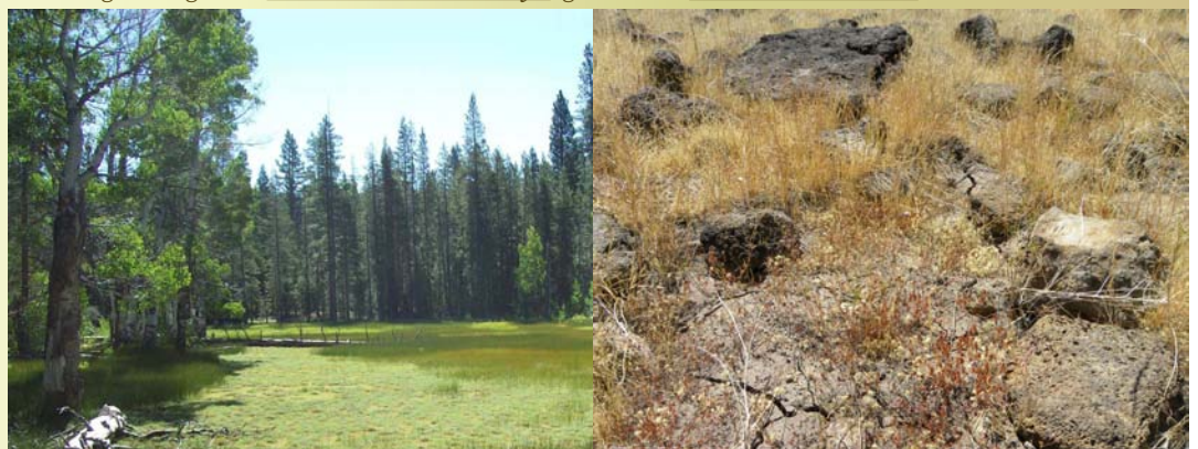
Figure 3. Vernal pools dry out completely in August-September. Their soil has cracks; most vernal pool plants set seeds and die. Dominant plants on the right image are: Deschampsia danthonioides (yellow), Polygonum polygaloides ssp. confertiflorum (brown), and Navarretia leucocephala ssp. minima (whitish).

Our data show that pools found in Lassen Volcanic and its vicinity are good representatives of Modoc Plateau vernal pools. Over 90% of California vernal pools have been destroyed and none of the remaining pools have as high a level of protection as the National Park Service can provide. The diversity of vernal pools within the park and especially in the areas adjacent to the park need further study. This knowledge can be incorporated in the management strategy to support sustainable existence of biodiversity of the Modoc Plateau region.