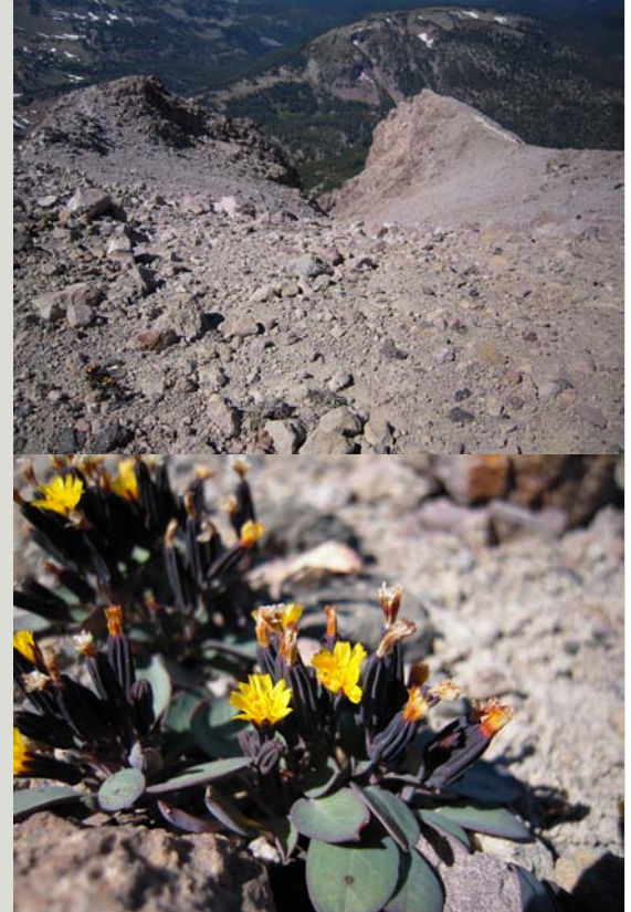
Dwarf alpine hawksbeard growing on Lassen Peak (top) and in detail (bottom).

While sampling Lassen Peak, as part of the vegetation mapping effort, we observed an unknown plant. It didn't fit the description of any species in the Flora of Lassen, and without proper magnification, the Jepson Manual was of no use. What could this species possibly be? Upon returning to the Ashland office, I was able to identify the unknown species as Dwarf Alpine Hawksbeard ( Crepis nana ). Here, I hit another obstacle: the physical characteristics fit but the distribution did not. It seemed the species was out of place on Lassen Peak. The only collections of C. nana in California were from the central/southern Sierra Nevada and the desert mountains near Death Valley. Further research revealed the species occurs at high elevations/latitudes on gravely substrates in western North America. So the habitat and ecology from Lassen Peak were a pretty good fit. And as a final reference, images of C. nana were examined and, Ah hah! Indeed, we had discovered a new species to Lassen Volcanic NP. The distance from the Lassen locality to the nearest collections ~150 miles to the southeast (Sonora