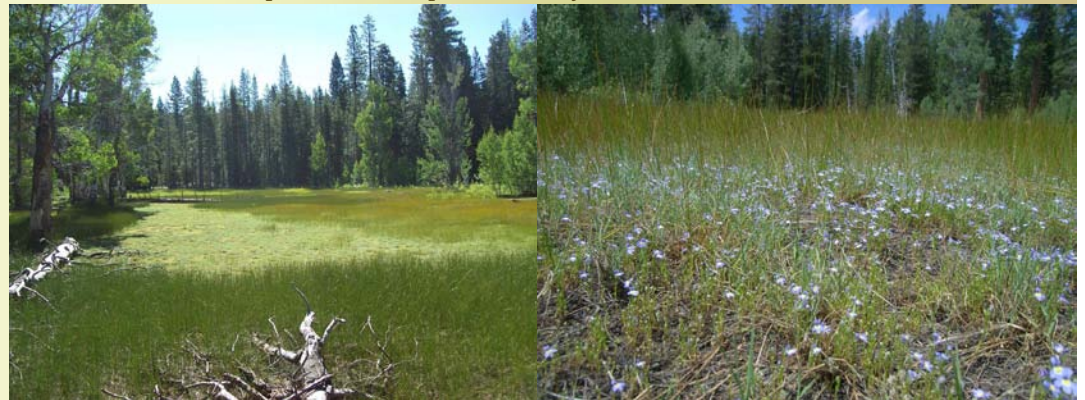
Figure 2. Lassen Volcanic vernal pools dry down in June-July. This is an optimal time for plant growth because the standing water is gone, soil is still moist, and the weather is at its warmest. Dominant plants on the right image are: Eleocharis macrostachya (green) and Porterella carnosula (blue).

California have remained largely un-documented; the data collected during this study form a valuable contribution to understanding vernal pool diversity. Several species that we found in Lassen pools ( Deschampsia danthonioides , Eleocharis macrostachya , and E. acicularis ) are common in most California vernal pools. Floristic distinctiveness of these pools from the rest of California pools is indicated by the presence of such endemic taxa as Porterella carnosula , Downingia bacigalupii , Eryngium alismifolium , Navarretia leucocephala ssp. minim , and Polygonum polygaloides ssp. confertiflorum . They also differ from most California vernal pools in that they are more natural and less invaded by non-native species, which are unfortunately abundant in lower elevation pools.