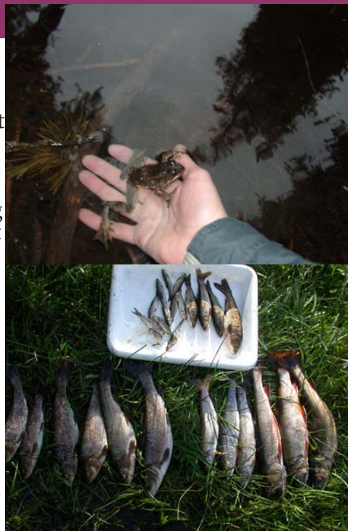
Top: Cascades frog near Juniper Lake. Bottom: Fish from Snag Lake.

Although the vast majority of lakes currently lack fish, effects of fish predation on lake food webs are obvious within larger, more productive lakes. Large invertebrate predators, such as dragonfly nymphs, predaceous diving beetle larvae, and backswimmers are much less abundant in lakes with fish, and the largest zooplankton species were only found in fishless lakes. These observations show that lake communities are relatively resilient in responding to the loss of fish predators and that the policy to stop stocking non-native fishes into LVNP lakes is allowing some components of the community to recover to pre-fish stocking conditions. Persistent and largely unexplained declines of amphibian populations, however, suggest that factors in addition to non-native fish introductions will continue to plague efforts to sustain the entirety of native biodiversity.