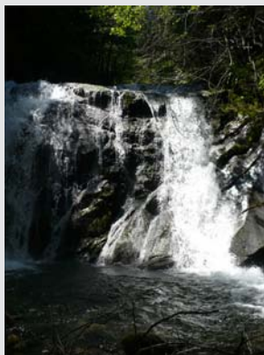
Brandy Creek Falls, Whiskeytown National Recreation Area.