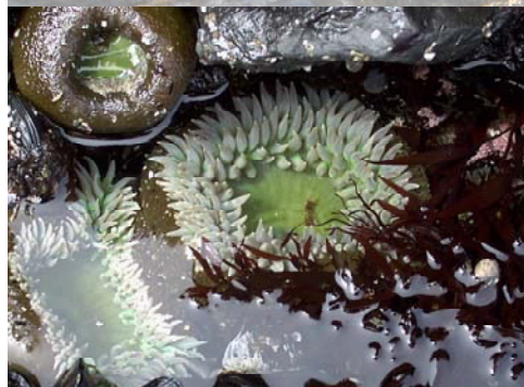
Sea anemones.

Having completed the Klamath Network Vital Signs Monitoring Plan in September 2008, the Network has been able to turn their focus to developing and implementing monitoring protocols for each of our 10 vital signs. After a four year process and through an outstanding effort by university, park, and Network staff, the Klamath Network has completed our first monitoring protocol, entitled “Long-term Monitoring Protocol for Rocky Intertidal Communities of Redwood National and State Parks (RNSP), California.” Staff from Redwood National Park, the Inventory and Monitoring Program, University of California, and Southern Oregon University worked together to complete the pilot study and monitoring protocol for this vital sign.