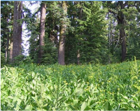
A moist meadow community dominated by false hellebore and arrowleaf groundsel at Crater Lake. This community type was among the most species rich of those we sampled.

By Cheryl Bartlett, Oregon State University