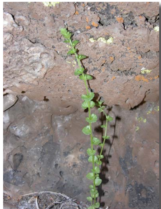
Heterocodon rariflorum is rare at Lava Beds National Monument. The entire population of this rare flowered member of the Campanulaceae family is represented by two individuals growing at Post Office Cave.