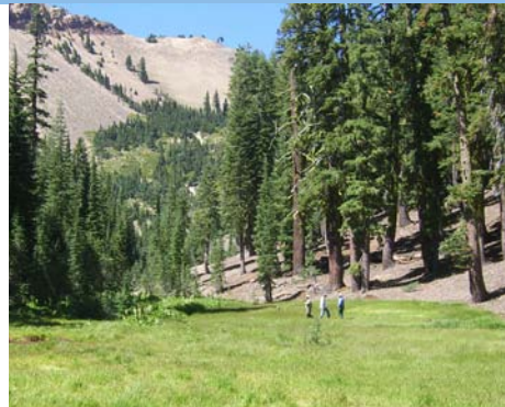
A scenic wet meadow/fen in the Forest Lake drainage of Lassen Volcanic National Park. It was later determined that a portion of this wetland was very likely a rare acid geothermal fen.