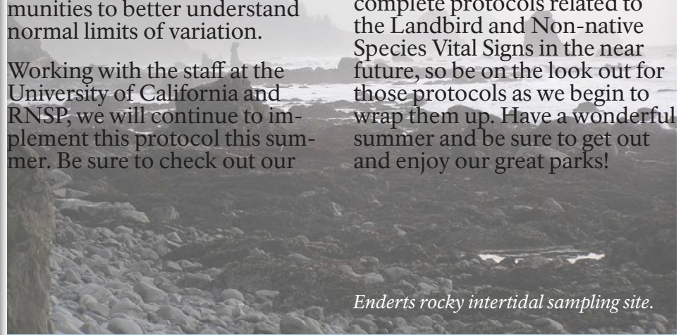
Enderts rocky intertidal sampling site.

In addition to the Intertidal protocol, the Klamath Network is making their best efforts to complete protocols related to the Landbird and Non-native Species Vital Signs in the near future, so be on the look out for those protocols as we begin to wrap them up. Have a wonderful summer and be sure to get out and enjoy our great parks!