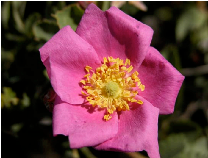
Rosa woodsii var. ultramontana is occasional along the northern border of Lava Beds National Monument. A plant of moist places, it is restricted to the margins of Tule Lake.

During the course of this project, 89 species (and the list is still growing) were added to the Lava Beds National Monument vascular plant list. I collected many of these species; others, found through a query of the California Consortium of Herbaria, were collected in the past but not reported to monument personnel. In total, 361 (again, a list that is still growing!) vascular plant species have been collected from Lava Beds.