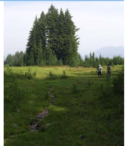
A high elevation wetland at Crater Lake. A cluster of small wetlands (including this one) found in the area were floristically unique from all other wetlands sampled in the park.

For most visitors to Lassen Volcanic and Crater Lake National Parks, a trip wouldn't be complete without stopping to admire a lush meadow, relaxing in the shade along an alder-lined creek, or contemplating life among the sedges that ring many of the lakes and ponds in these two parks. Each of these experiences have, at their core, interactions with wetland plant communities, which in addition to their scenic value, also play a vital ecological role on the landscape by providing habitat for wildlife, being biodiversity hotspots, storing water, and sequestering carbon.