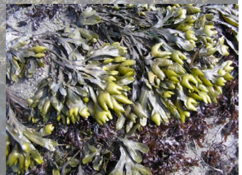
Fucus gardneri at False Klamath Cove.

The major objectives of this protocol include: (1) monitor the temporal dynamics of target invertebrate and algae and surfgrasses across accessible, representative, and historically sampled rocky intertidal sites; (2) determine status, trends, and effect sizes through time for morphology, color ratios, and other key parameters describing population status (e.g., size, structure) of the selected intertidal organisms; (3) integrate with and contribute to a monitoring network spanning a broad geographic region, in order to evaluate trends at multiple scales, from the park to region-wide, taking advantage of greater sample sizes at broader scales; and