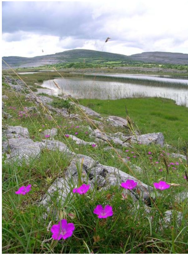
Bloody cranesbill ( Geranium sanguineum ) and Skaghard Lough, Burren National Park, Ireland.

the summer often have extensive marl flats that evoke the saline playas of the Great Basin, with specialized species like shoreweed ( Littorela uniflora ) and many-stalked spike-rush ( Eleocharis multicaulis ).