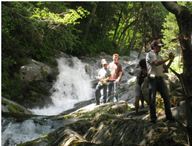
Top: Whiskeytown Lake, viewed from the Visitor Center. Bottom: Some of Southern Oregon University's International Student Association members enjoying Brandy Creek Falls.

in our lives, but when I glanced at the faces of the other hikers, none of them looked tired. Instead, I saw rays of enthusiasm. At that point, I realized that nature is really powerful. I felt like we were being powered by that same stream, Brandy Creek, which was singing in its own way down the hill and by that green forest which was blooming in its fullest at the height of spring. We all talked about how this experience compared to protected areas in our home countries and how interesting it was to explore somewhere outside of Ashland!