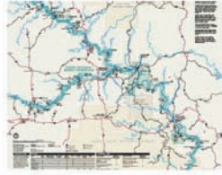
Ozark National Scenic Riverways

The OZAR and EFMO projects come on the heels of initiating General Management Planning (GMP) at both parks. The results of the Overview Assessment may contribute to the GMP process, and will most certainly inform the subsequent Resource Stewardship Strategies. The WCA and regional science