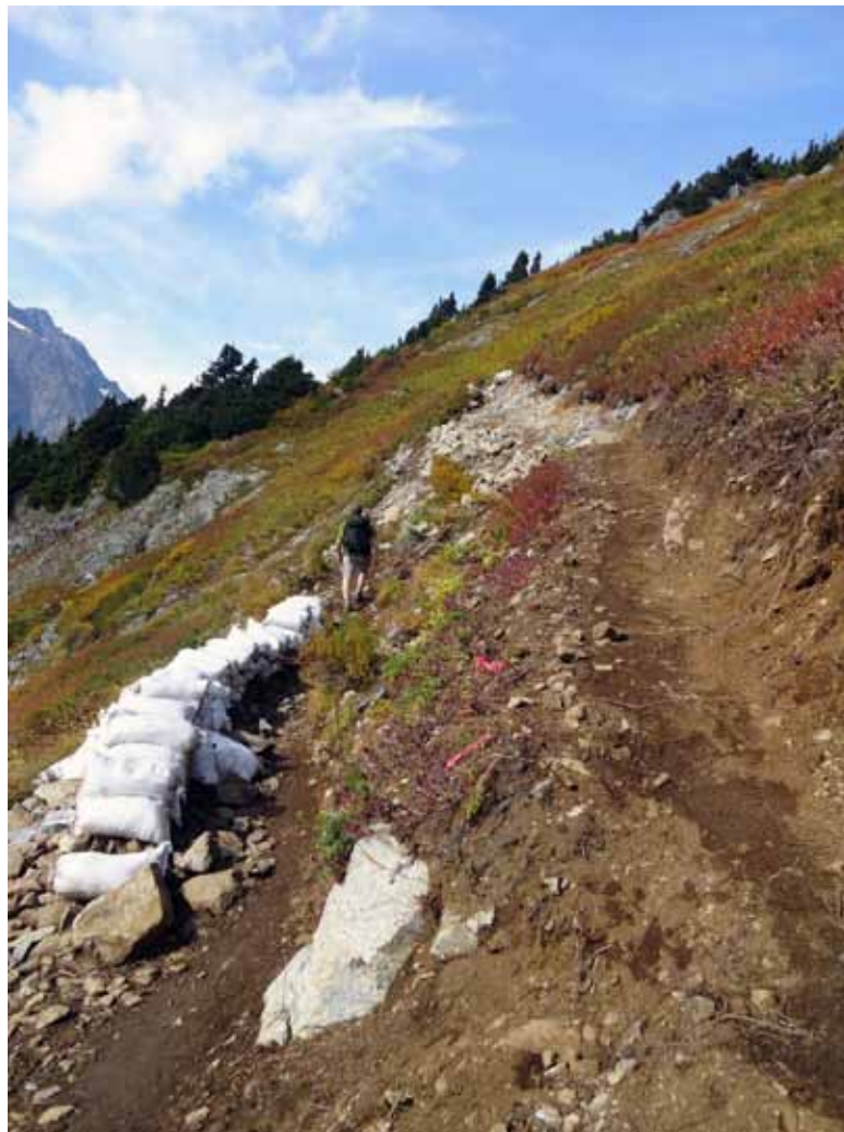
New switchback cut into fragile alpine meadow on Sabale Arm as part of helicopter-supported trail construction by NPS.

The Cascade Pass area is protected to the maximum extent of the law, in designated Wilderness inside National Park. So as our member says, helicopters should not be there for any purpose other than emergency rescues, as per the Wilderness Act.