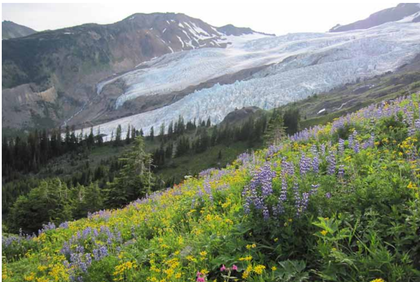
Wildflowers carpet the moraines above the seracs of the Coleman Glacier; Roosevelt Glacier terminus beyond.

Non-Profit Organization U.S. POSTAGE PAID SEATTLE, WA PERMIT No. 8602