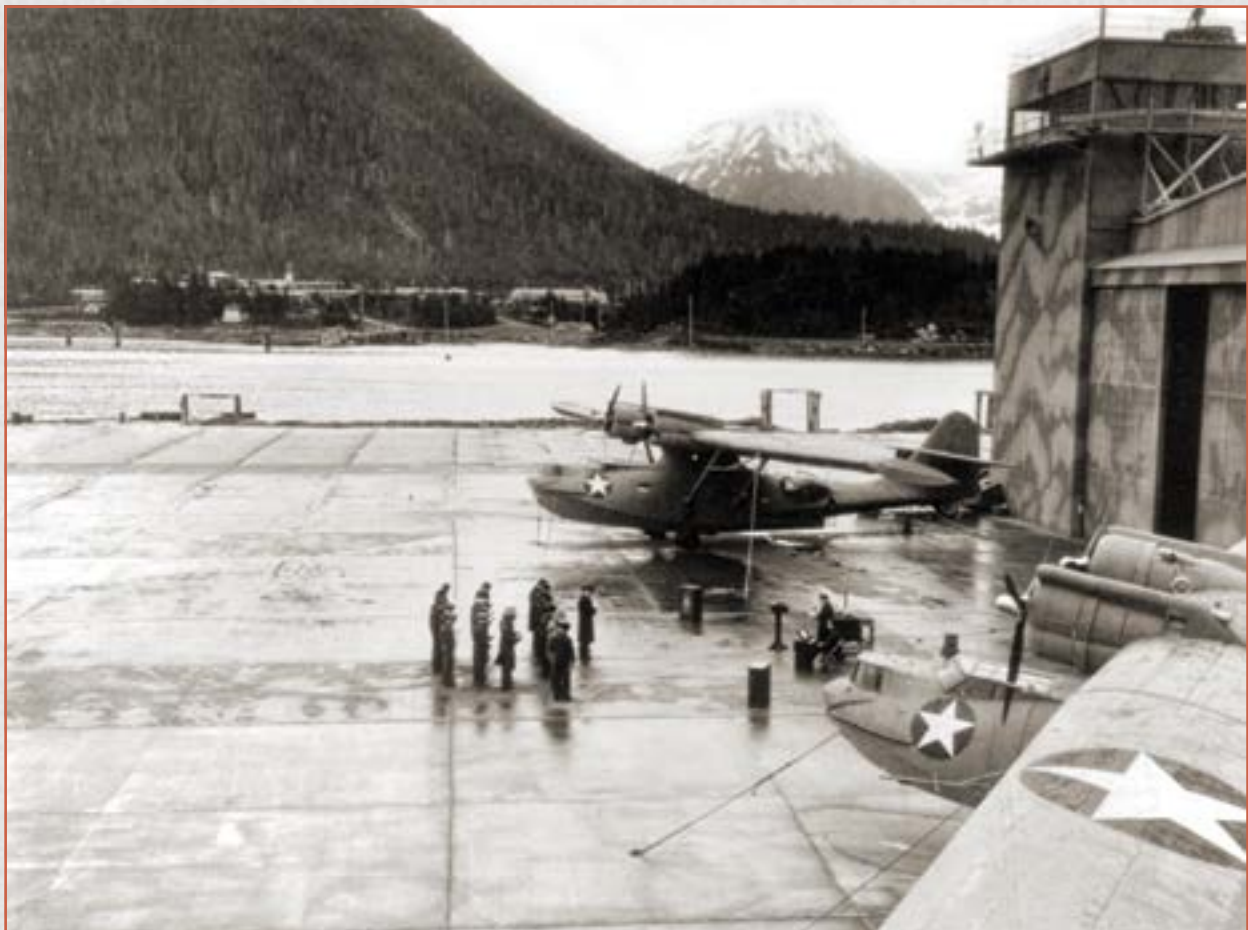
Sitka Naval Operating Base, Easter Service, 1943.

SLED offers access to library catalogs and other resources of interest to Alaskans under the slogan "information resources for, about and by Alaskans."