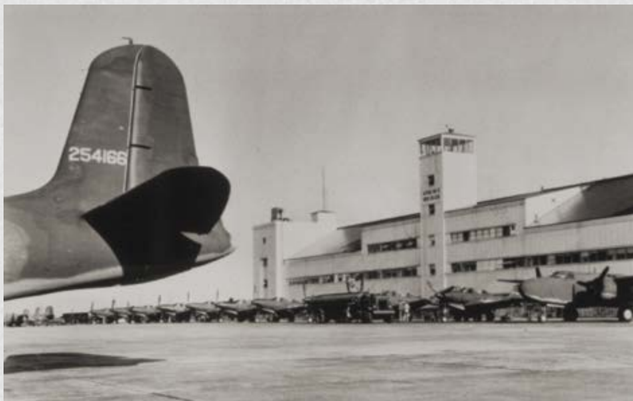
Lend-Lease planes on the apron of Hangar 1, Ladd Field, Fairbanks, circa 1944, including A-20s and P-39s.