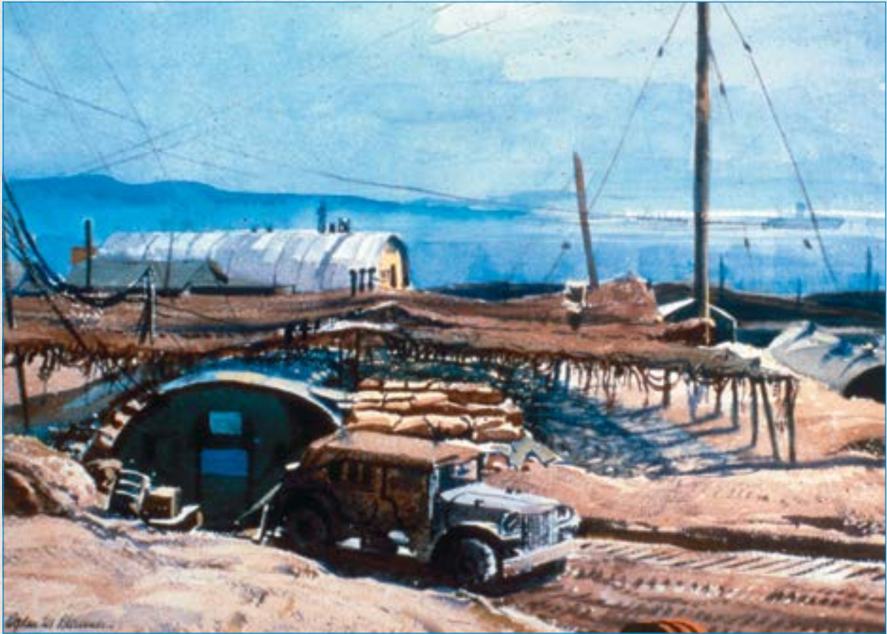
“Headquarters, camouflage Umnak” by Ogden Pleissner.

Front Cover: American and Canadian soldiers made an amphibious landing on the island of Kiska, August 16, 1943. The Japanese, however, had already evacuated the island three weeks earlier under the cover of fog. Shown are the Infantrymen of the 13th Canadian Infantry Brigade Group disembarking from a landing craft during operation COTTAGE, the invasion of Kiska.