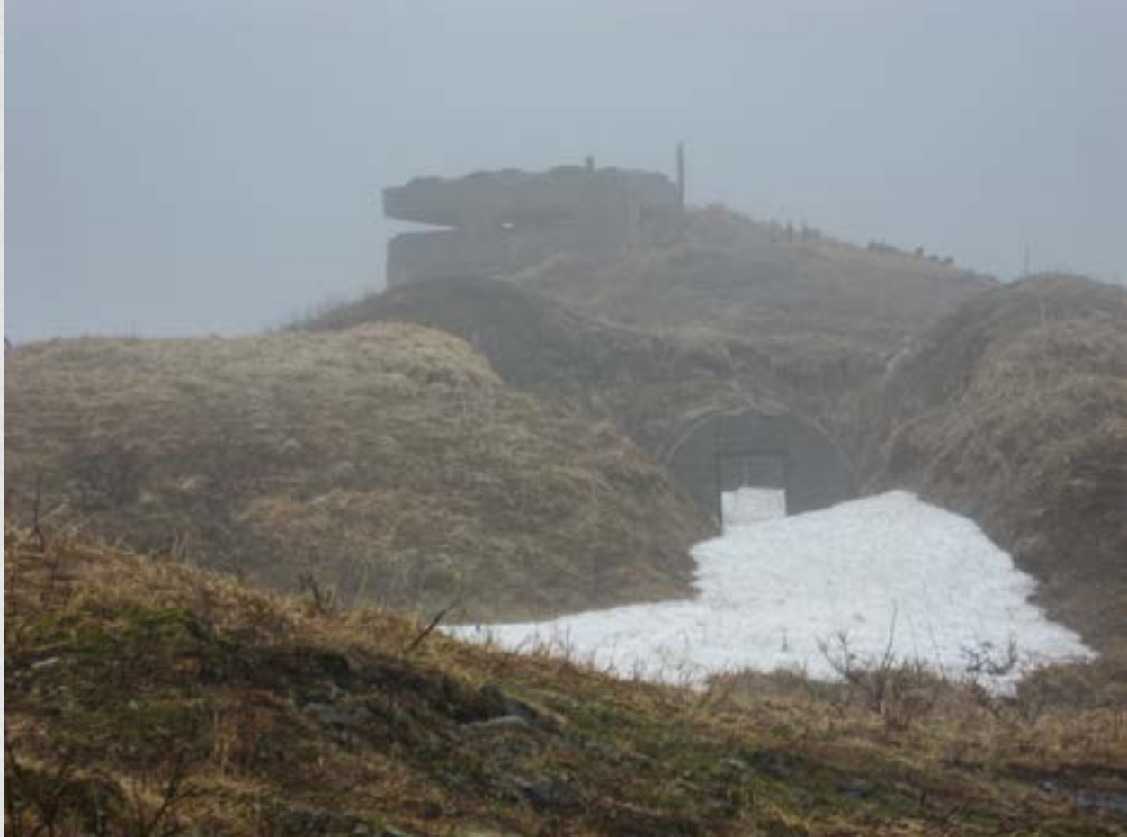
Ulakta Head and Command Center, a feature within the Dutch Harbor NHL and the Aleutian World War II National Historic Area.

The Secretary of the Interior, through the National Park Service, designated the following NHL sites to commemorate the significant events and human drama of Alaska's role in World War II: