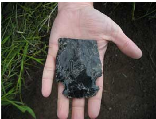
This large knife from a site near Lake Lodge tested positive for bear protein, as well as cat and deer. (Doug MacDonald)

Hunting bears just as they emerge from hibernation was widely incorporated into the rounds of northern latitude hunter-gatherers around the world. Bears have been observed on three islands, and at least one island had a hibernation den. Hibernating bears certainly would have encouraged humans to traverse ice, especially if the hunter had pre-scouted the presence of a den prior to snowfall. Among many Native American cultures, the killing of a bear was often not just for food but also perceived to bring wisdom and strength to the hunter. Bear is also the second most common type of protein identified on stone tools at Yellowstone Lake sites, suggesting that bear hunting was fairly common. Thus, the archeological sites on the islands may be associated with bear hunting.