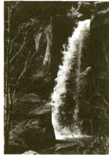
LOWER FALLS, FRIJOLES CREEK