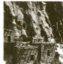
RESTORED TALUS HOUSE