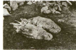
SHRINE OF THE STONE LIONS